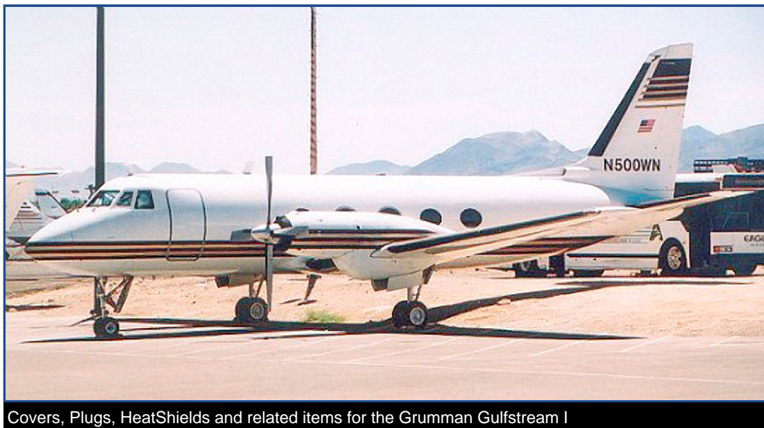
Covers, Plugs, HeatShields and related items for the Grumman Gulfstream I