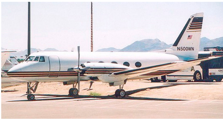
Covers, Plugs, HeatShields and related items for the Grumman Gulfstream I