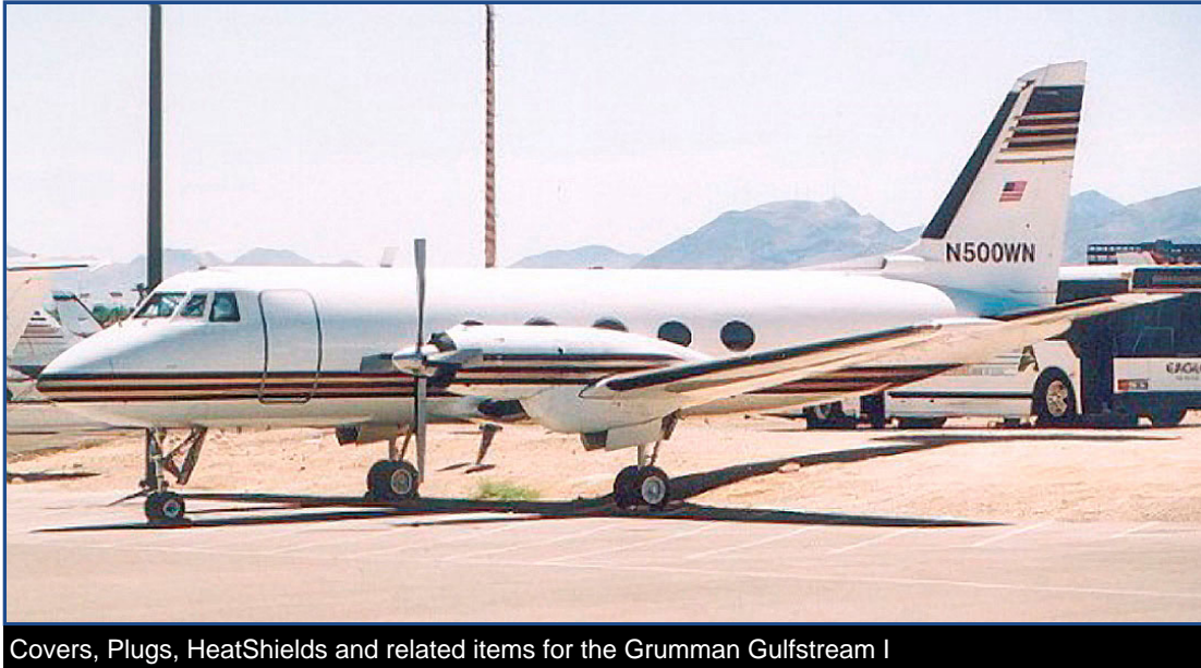
Covers, Plugs, HeatShields and related items for the Grumman Gulfstream I