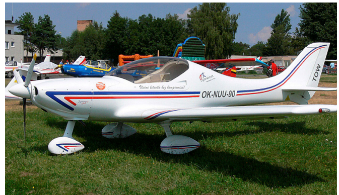
Covers, Plugs & HeatShields for Dynamic WT9