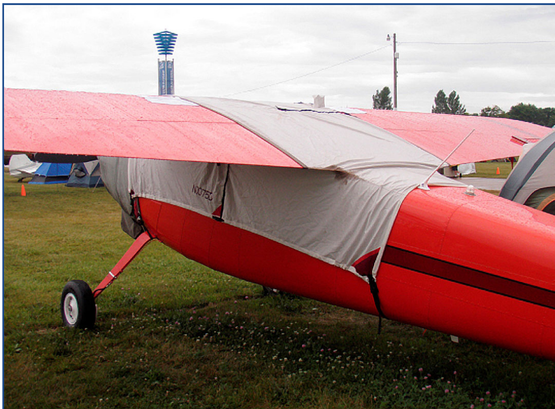
Over-Top Canopy Cover &amp; Engine Cover