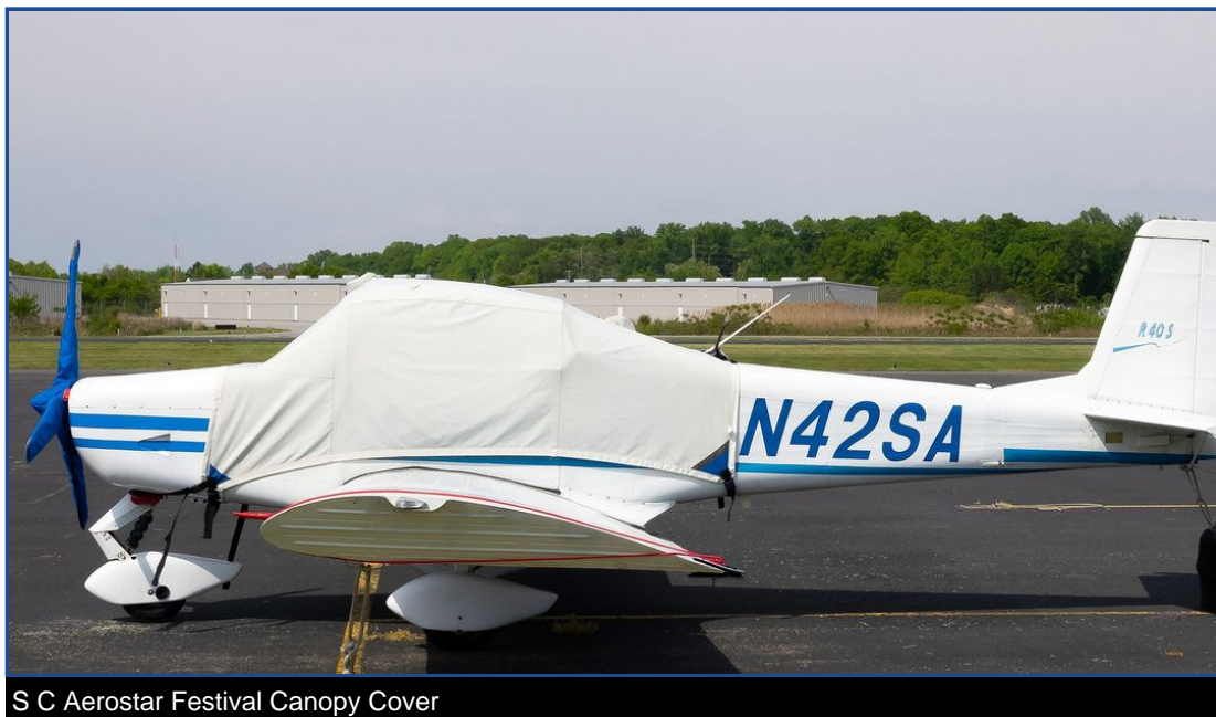
S C Aerostar Festival Canopy Cover