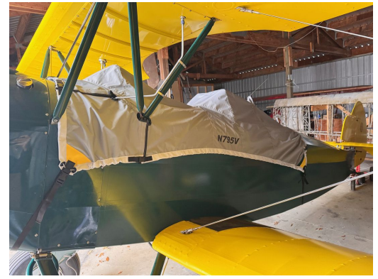
Fleet Model 7 Canopy Cover, Travel Weight