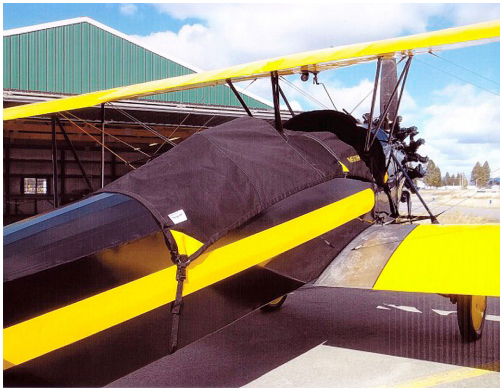
Stearman C3 Canopy Cover