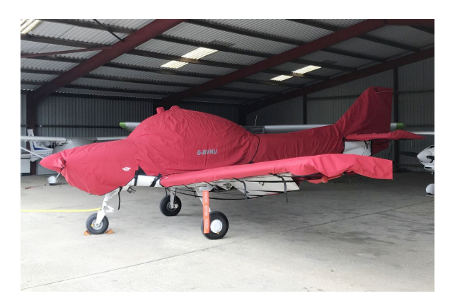
FLS Club Sprint Engine Cover