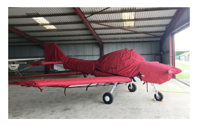
FLS Club Sprint Extended Canopy Cover

Covers developed this material combination especially for aircraft protection. The outer material is medium weight and treated for water resistance, UV resistance and anti-static buildup. The inner lining is a very soft and smooth microfiber to prevent scratching. The material is very reflective, and tests show that the cabin interior temperature can be reduced to near-ambient temperature on the hottest of days. It is water, ice and snow repellent, yet breathable to allow moisture to escape from between the cover and the aircraft surface.