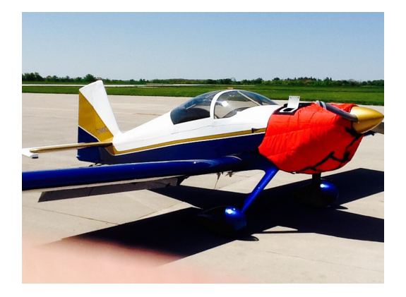
Van's RV-7 Insulated Engine Cover

Engine Covers will cinch around or behind the spinner, cover the entire engine cowl area including the engine air cooling and induction air inlets, and fastens together with Velcro beneath the spinner down the front of the cowling. The Engine Cover is attached with a belly strap aft of the firewall, and can Velcro to the Canopy Cover. Engine Covers are normally made from Solution-Dyed Polyester or Acrylic Sunbrella . An Insulated version of the engine cover can be made with a thicker, quilted, and water-repellent material. The Insulated Engine Cover works well in cold climates to help with engine preheating.