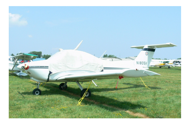
Beech Skipper Canopy Cover, Engine Plugs