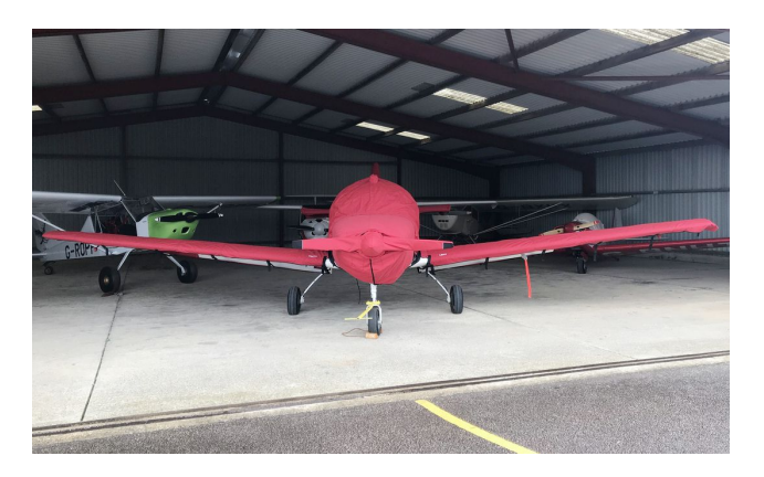
FLS Club Sprint Empennage Cover (Tailboom, Vertical & Horiz Stabilizers) All Year Use

WINTER USE MATERIAL - Made with Solution-Dyed Polyester fabric, this option is intended for seasonal use to aid in deicing, rain mitigation, or for occasional travel. The material is lighter and more compact, but more susceptible to UV damage and may have a shorter useful life if used continuously outside than the all-year use material.