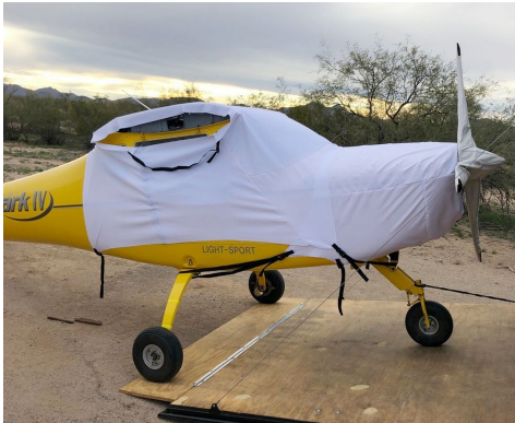
FK-Lightplanes FK-9 Canopy & Engine Covers, test fit covers FK-Lightplanes FK-9 Canopy & Engine Covers, test fit covers