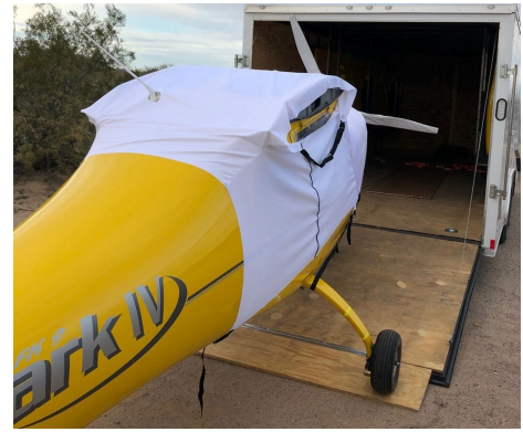
FK-Lightplanes FK-9 Canopy Cover, test fit cover