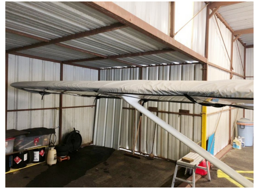
FK 9 MARK IV Wing Dust Covers