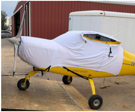
FK-Lightplanes FK-9 Canopy & Engine Covers, test fit covers