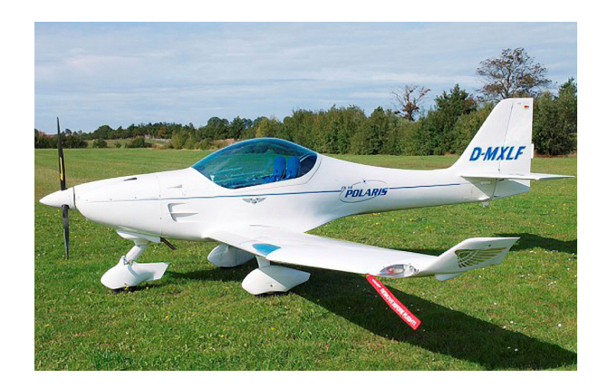
Covers & Plugs for the FK-14 Polaris