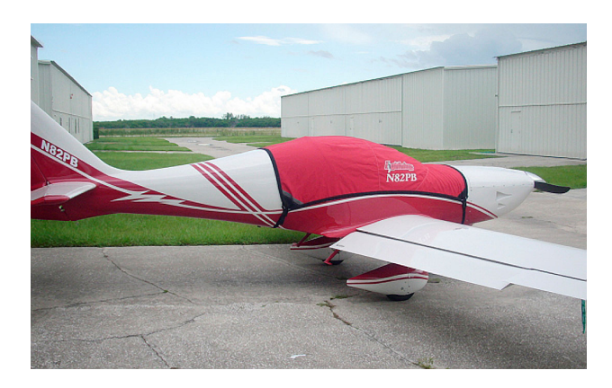
Lightning Canopy Cover