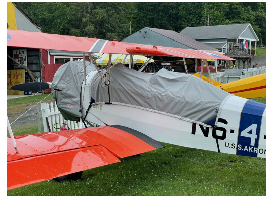
Fleet Biplane Model 1 Canopy & Engine Covers