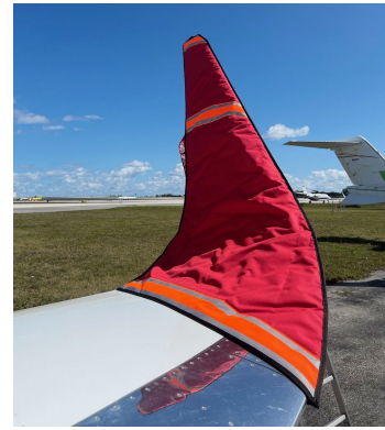
Falcon Jet 900 Winglet Padding Covers