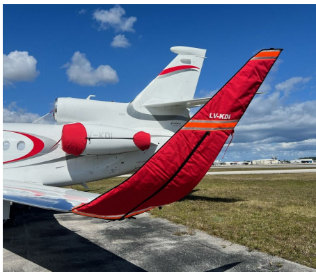
Falcon Jet 900 Winglet Padding Covers