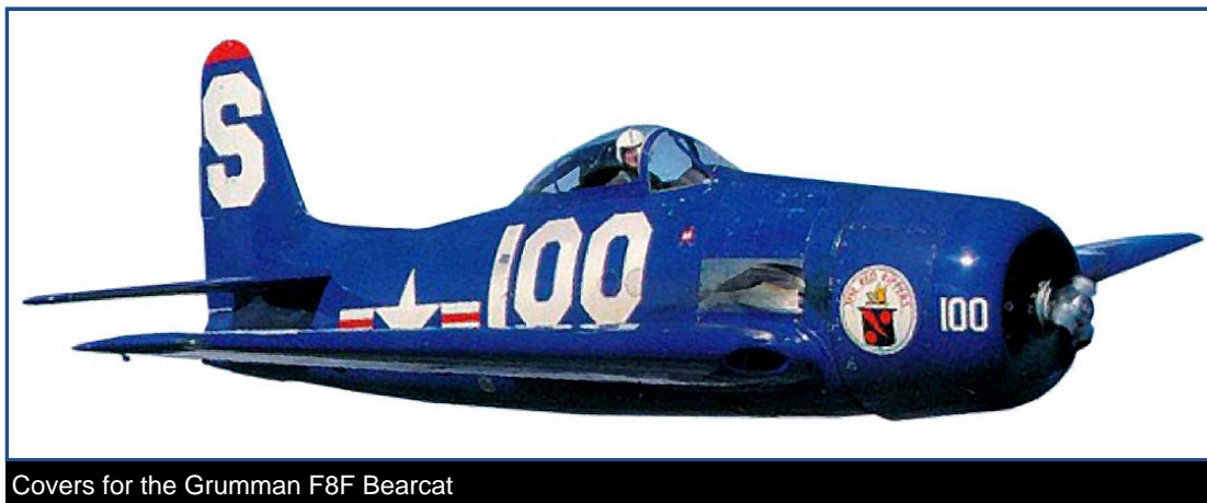
Covers for the Grumman F8F Bearcat