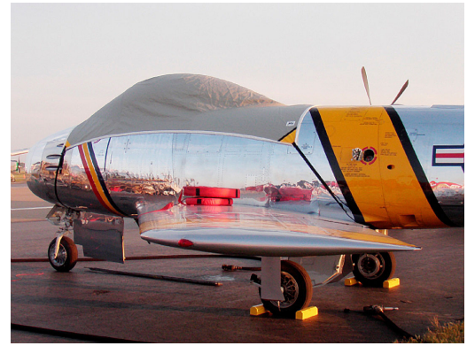
F86 Sabre Canopy Cover