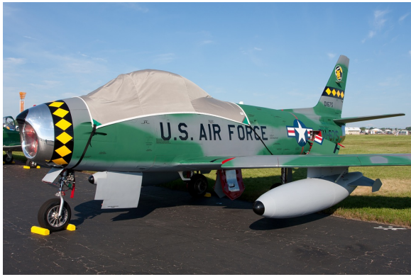
F86 Canopy Cover