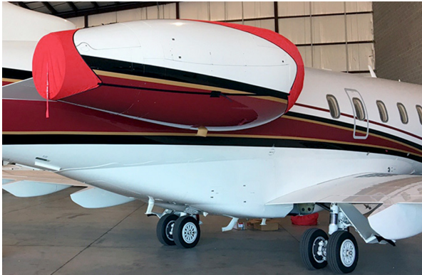
Intake/Exhaust Covers, 3-Strap Type. Successfully installed by two crew, one ladder.

The Falcon Jet 6X Bikini Style Engine Covers are a single-piece design using a soft and smooth stretchy and fabric. The cover stretches tightly over both the intake and exhaust, installing quickly and easily. These covers are designed to be used as hangar dust covers and have a useful life of approximately one year.