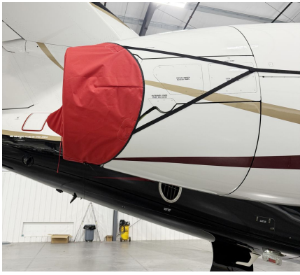
Dassault Falcon 6X Intake/Exhaust Covers (set of 4)