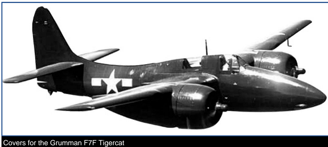
Covers for the Grumman F7F Tigercat