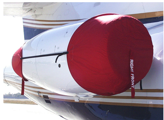
Falcon 50EX Outboard Intake/Exhaust Covers