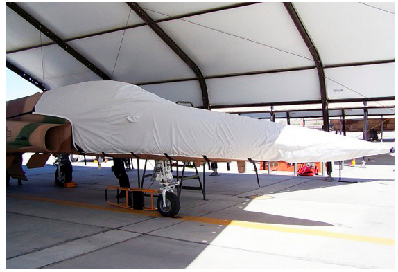
Northrup F-5 Talon Canopy/Nose Cover