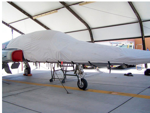
Northrup F5 Talon Canopy Cover