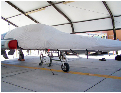
Northrup F5 Talon Canopy Cover