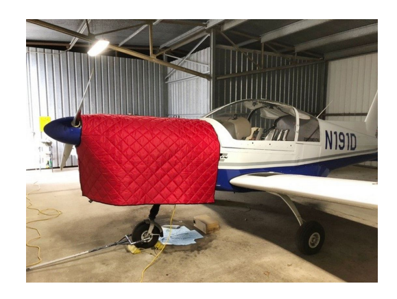
Zlin 142 Insulated Hangar Blanket

The material is very reflective, and tests show that the cabin interior temperature can be reduced to near-ambient temperature on the hottest of days. It is water, ice and snow repellent, yet breathable to allow moisture to escape from between the cover and the aircraft surface.