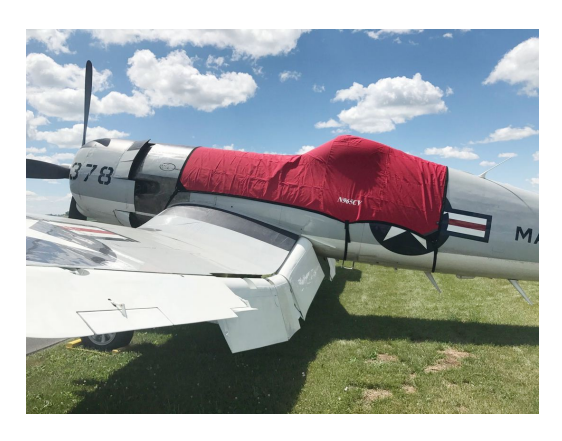
Chance-Vought F4U-7 Canopy Cover