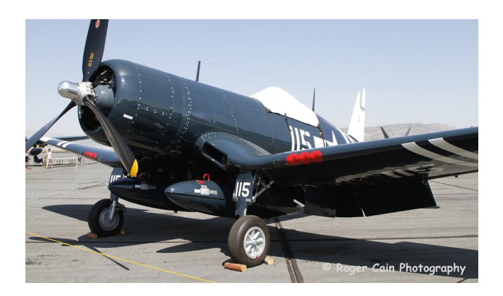
Chance Vought F4U Corsair Canopy Cover