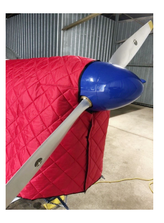
Zlin 142 Insulated Hangar Blanket