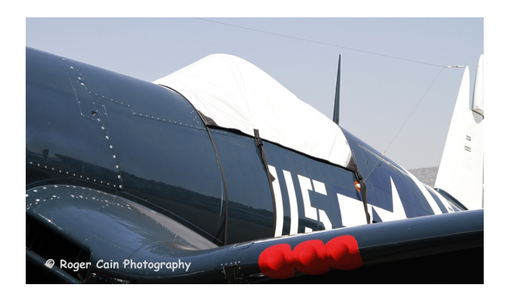
Chance Vought F4U Corsair