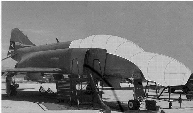
F4 Phantom Canopy/Nose Cover

This cover type is made from Silver Acrylic Sunbrella canvas and is 100% lined with a soft and smooth microfiber. Bruce's Custom Covers developed this material combination especially for aircraft protection. The outer material is medium weight and treated for water resistance, UV resistance and anti-static buildup. The inner lining is a very soft and smooth microfiber to prevent scratching. The material is very reflective, and tests show that the cabin interior temperature can be reduced to near-ambient temperature on the hottest of days. It is water, ice and snow repellent, yet breathable to allow moisture to escape from between the cover and the aircraft surface.