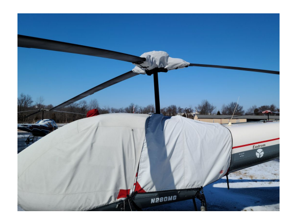
Enstrom 280C Shark Bubble, Engine & Rotor Hub Covers