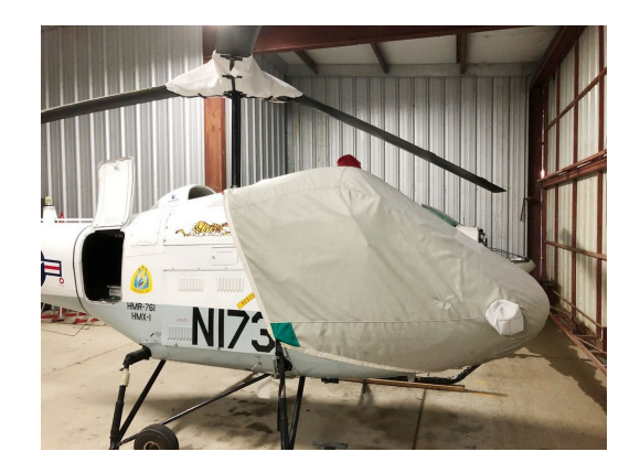
Enstrom F28A, F28C Bubble Cover "Flat Nose"