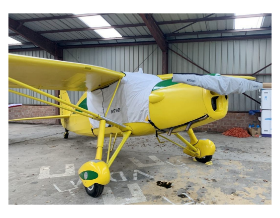
Fairchild 24 Over-Top Canopy Cover