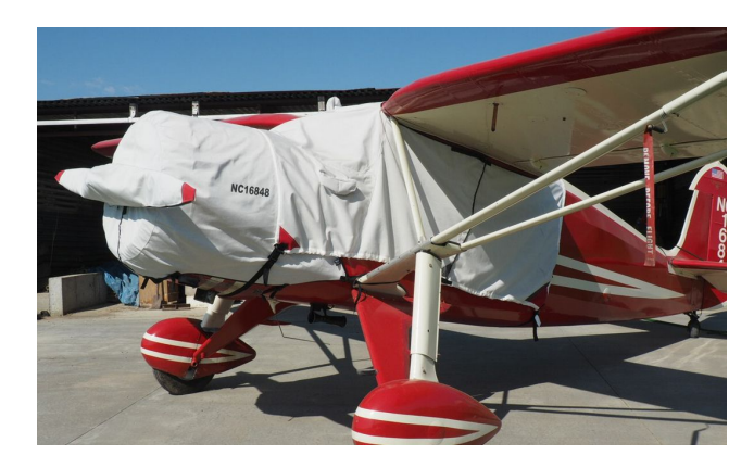
Fairchild 24W Canopy, Engine & Prop Cover

This cover type is made from Silver Acrylic Sunbrella canvas and is 100% lined with a soft and smooth microfiber. Bruce's Custom Covers developed this material combination especially for aircraft protection. The outer material is medium weight and treated for water resistance, UV resistance and anti-static buildup. The inner lining is a very soft and smooth microfiber to prevent scratching. The material is very reflective, and tests show that the cabin interior temperature can be reduced to near-ambient temperature on the hottest of days. It is water, ice and snow repellent, yet breathable to allow moisture to escape from between the cover and the aircraft surface.