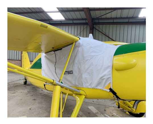
Fairchild 24 Over-Top Canopy Cover

Travel Covers are made with Silver Solution-Dyed Polyester fabric and only lined over the windshield to save weight. The material is lightweight and more compact for easy stowage in the aircraft. The polyester material is water resistant, but only intended for occasional use outside. We also have an ultra lightweight material available for fitted hangar dust covers. For daily outdoor use, the non-travel Sunbrella Cover is the best choice.