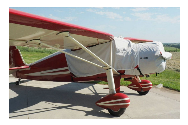
Fairchild 24W Canopy, Engine & Prop Cover