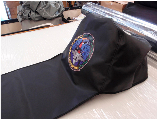
F22 Raptor Ejection Seat Maintenance Cover