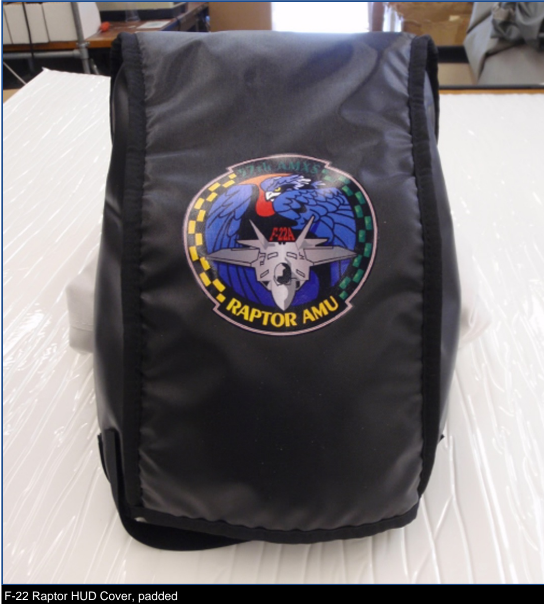
F-22 Raptor HUD Cover, padded