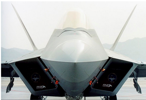
F-22 Raptor Engine Inlet Plugs Set

The Engine Inlet Plugs are custom fit for your Lockheed Martin/Boeing F-22 Raptor intakes, made with heavy-duty vinyl material, and stuffed with a single block of sculpted urethane foam. Each plug has a zipper that allows the foam to be removed and dried if necessary. Engine plugs have 'remove before flight' streamers sewn onto the face of the plugs. Most plugs are imprinted with the aircraft registration number in black for an extra charge. Storage bag NOT included. Engine plugs may be inserted after flight when the engine is still warm. Engine Inlet Plugs are commonly referred to as Cowl Plugs, Intake Plugs, Cowl Blocks, Engine Blocks, and Engine Bungs.