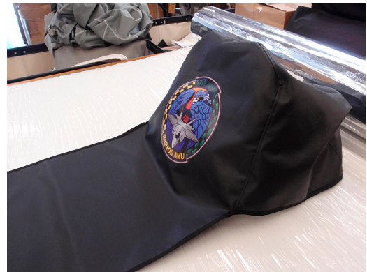
F22 Raptor Ejection Seat Maintenance Cover