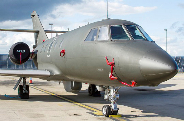
Falcon Engine Covers (not our probe covers)

The Engine Inlet Plugs are custom fit for your Falcon Jet 200 (20H) intakes, made with heavy-duty vinyl material, and stuffed with a single block of sculpted urethane foam. Each plug has a zipper that allows the foam to be removed and dried if necessary. Engine plugs have 'remove before flight' streamers sewn onto the face of the plugs. Most plugs are imprinted with the aircraft registration number in black for an extra charge. Storage bag NOT included. Engine plugs may be inserted after flight when the engine is still warm. Engine Inlet Plugs are commonly referred to as Cowl Plugs, Intake Plugs, Cowl Blocks, Engine Blocks, and Engine Bungs.