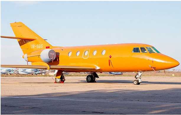
Falcon Engine Covers

The Falcon Jet 20 (HU-25) Bikini Style Engine Covers are a single-piece design using a soft and smooth stretchy and fabric. The cover stretches tightly over both the intake and exhaust, installing quickly and easily. These covers are designed to be used as hangar dust covers and have a useful life of approximately one year.