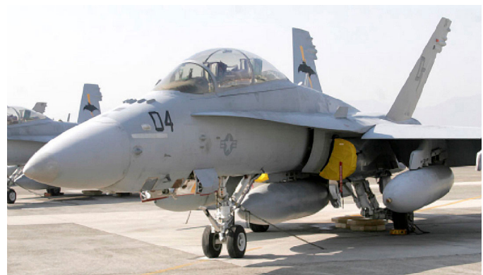
F-18 Intake Cover Set