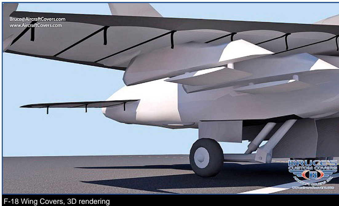
F-18 Wing Covers, 3D rendering