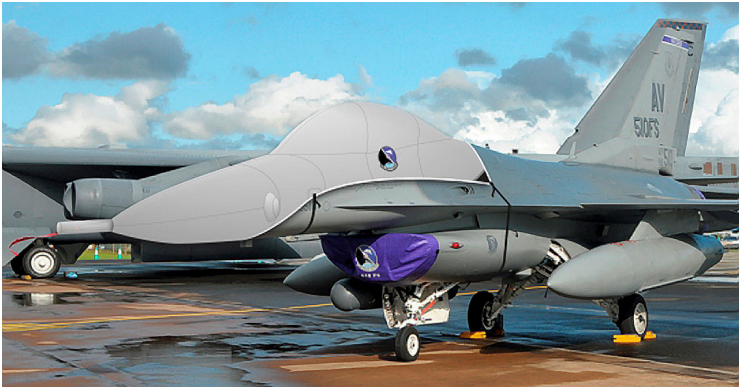
F-16 Canopy/Nose Cover