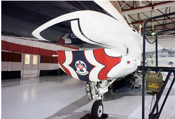
Intake Cover & Folding Intake Plug