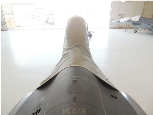
F-16 CANOPY COVER, OPEN POSITION (C-Model, single seat models)