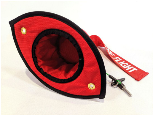
General Dynamics F-16 AOA Probe Cover

The Engine Inlet Plugs are custom fit for your General Dynamics F-16 Fighting Falcon intakes, made with heavy-duty vinyl material, and stuffed with a single block of sculpted urethane foam. Each plug has a zipper that allows the foam to be removed and dried if necessary. Engine plugs have 'remove before flight' streamers sewn onto the face of the plugs. Most plugs are imprinted with the aircraft registration number in black for an extra charge. Storage bag NOT included. Engine plugs may be inserted after flight when the engine is still warm. Engine Inlet Plugs are commonly referred to as Cowl Plugs, Intake Plugs, Cowl Blocks, Engine Blocks, and Engine Bungs.