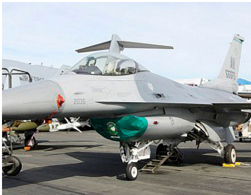
F-16 Intake Cover