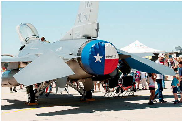
F-16 Exhaust Cover w/ custom art

The General Dynamics F-16 Fighting Falcon Intake Covers are designed to install easily yet be completely storable. A spring steel hoop is sewn into the hem of each cover, allowing them to be installed without climbing onto the wing or using a stepladder. To store the covers the spring steel hoop folds like a band-saw blade into three nesting rings. Each cover folds into a compact circular bundle which is stored in the included duffle bag, yet they unfold quickly for use. The Tri-Fold Ring cover is made of medium weight nylon which is available in a variety of colors to match the paint trim. Each cover set comes complete with installation and folding instructions. The aircraft's registration number can be silkscreened onto the cover for an extra charge.