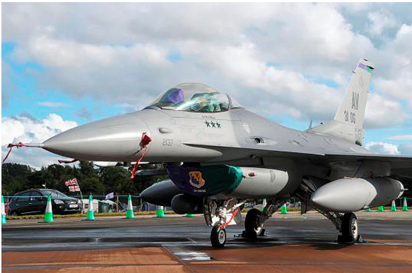
Intake, Maintenance Seat & HUD display covers (Aviano AFB, Italy)