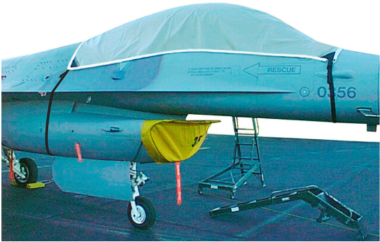
Canopy Cover, F-16

Travel Covers are made with Silver Solution-Dyed Polyester fabric and only lined over the windshield to save weight. The material is lightweight and more compact for easy stowage in the aircraft. The polyester material is water resistant, but only intended for occasional use outside. We also have an ultra lightweight material available for fitted hangar dust covers. For daily outdoor use, the non-travel Sunbrella Cover is the best choice.