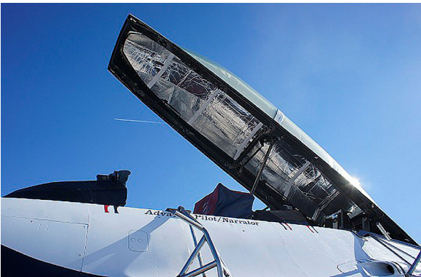
F-16 Cockpit HeatShields