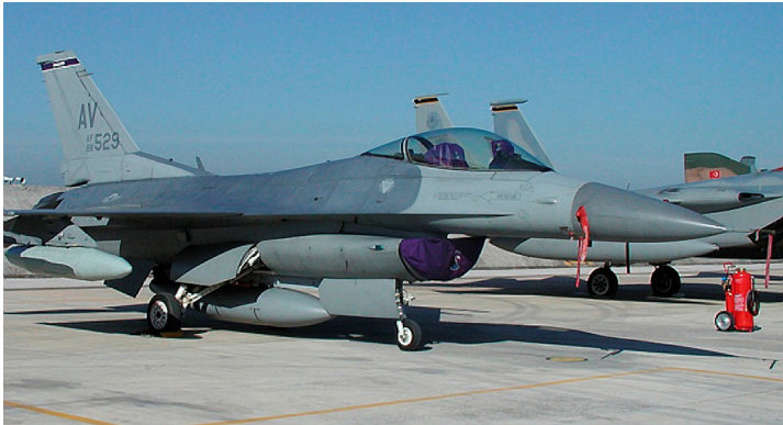
Intake, Maintenance Seat & HUD display covers (Aviano AFB)

The General Dynamics F-16 Fighting Falcon Intake Covers are designed to install easily yet be completely storable. A spring steel hoop is sewn into the hem of each cover, allowing them to be installed without climbing onto the wing or using a stepladder. To store the covers the spring steel hoop folds like a band-saw blade into three nesting rings. Each cover folds into a compact circular bundle which is stored in the included duffle bag, yet they unfold quickly for use. The Tri-Fold Ring cover is made of medium weight nylon which is available in a variety of colors to match the paint trim. Each cover set comes complete with installation and folding instructions. The aircraft's registration number can be silkscreened onto the cover for an extra charge.