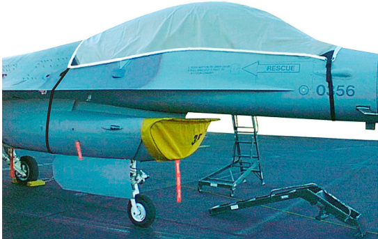
Canopy Cover, F-16

This cover type is made from Silver Acrylic Sunbrella canvas and is 100% lined with a soft and smooth microfiber. Bruce's Custom Covers developed this material combination especially for aircraft protection. The outer material is medium weight and treated for water resistance, UV resistance and anti-static buildup. The inner lining is a very soft and smooth microfiber to prevent scratching. The material is very reflective, and tests show that the cabin interior temperature can be reduced to near-ambient temperature on the hottest of days. It is water, ice and snow repellent, yet breathable to allow moisture to escape from between the cover and the aircraft surface.