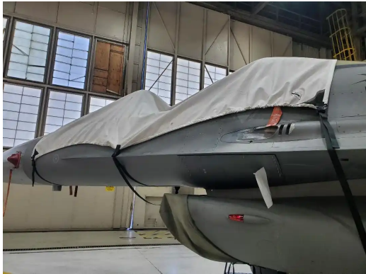
F-16 C-Model Single Seat Canopy Cover Open Position