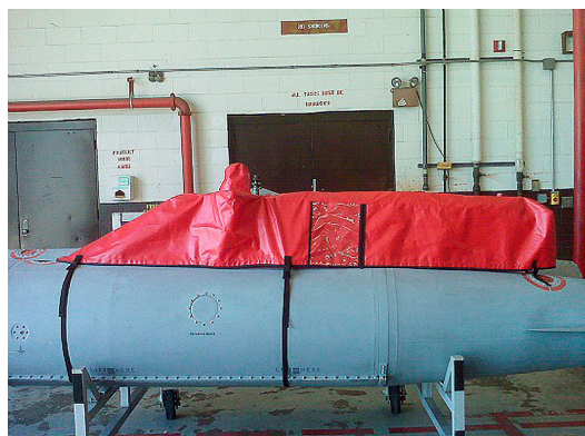
370 gal. WING FUEL TANK PYLON COVER, with/without forms pouch