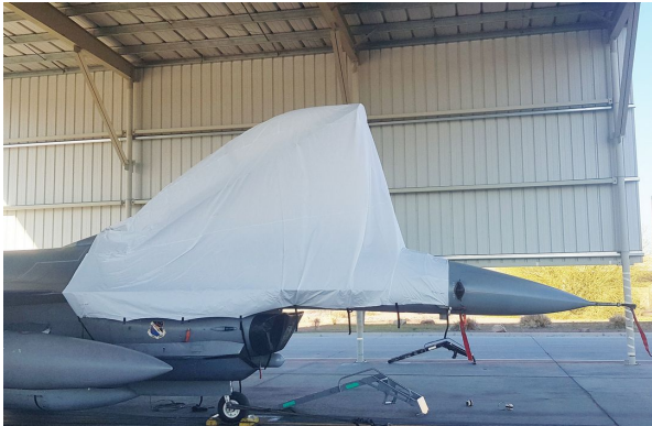
McDonnell Douglas F16-D Canopy Cover, open cockpit type (test fit cover)

This cover type is made from Silver Acrylic Sunbrella canvas and is 100% lined with a soft and smooth microfiber. Bruce's Custom Covers developed this material combination especially for aircraft protection. The outer material is medium weight and treated for water resistance, UV resistance and anti-static buildup. The inner lining is a very soft and smooth microfiber to prevent scratching. The material is very reflective, and tests show that the cabin interior temperature can be reduced to near-ambient temperature on the hottest of days. It is water, ice and snow repellent, yet breathable to allow moisture to escape from between the cover and the aircraft surface.