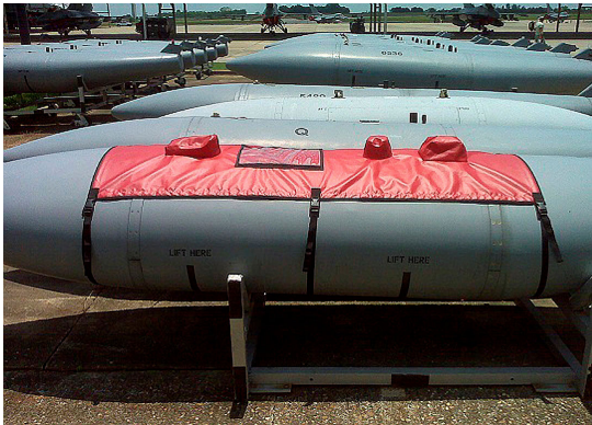
300 gal. CENTERLINE FUEL TANK PYLON COVER, with/without forms pouch