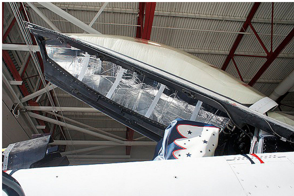
F-16 Cockpit HeatShields and Maintenance Seat Cover

Cockpit Heatshields are interior sunshades for the aircraft's cockpit. The product is a unique composite of closed-cell foam with a silver mylar finish. The semi-rigid design is stiff enough to stand inside the window framing. The set folds up flat and is easily stored in the included storage sleeve. Some designs may require velcro and suction cups. Our Heatshields for jets are offered white side out because some aircraft manufacturers have issued advisories against reflective window inserts due to potential heat damage. A Heatshield is an excellent short-term remedy for cockpit overheating, but an external fabric cover is more effective for long-term protection.