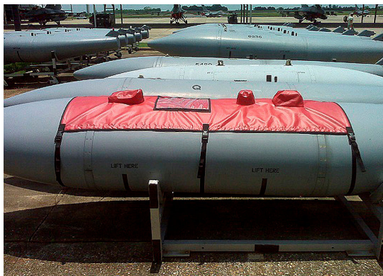
300 gal. CENTERLINE FUEL TANK PYLON COVER, with/without forms pouch

WINTER USE MATERIAL - Made with Solution-Dyed Polyester fabric, this option is intended for seasonal use to aid in deicing, rain mitigation, or for occasional travel. The material is lighter and more compact, but more susceptible to UV damage and may have a shorter useful life if used continuously outside than the all-year use material.