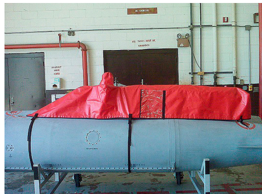
370 gal. WING FUEL TANK PYLON COVER, with/without forms pouch