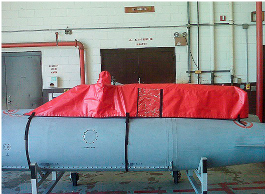
370 gal. WING FUEL TANK PYLON COVER, with/without forms pouch

WINTER USE MATERIAL - Made with Solution-Dyed Polyester fabric, this option is intended for seasonal use to aid in deicing, rain mitigation, or for occasional travel. The material is lighter and more compact, but more susceptible to UV damage and may have a shorter useful life if used continuously outside than the all-year use material.