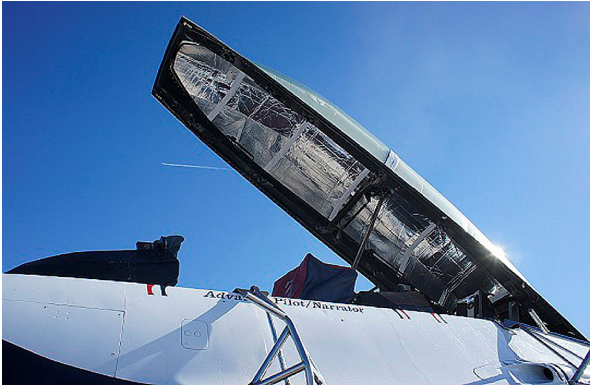
F-16 Cockpit HeatShields

Cockpit Heatshields are interior sunshades for the aircraft's cockpit. The product is a unique composite of closed-cell foam with a silver mylar finish. The semi-rigid design is stiff enough to stand inside the window framing. The set folds up flat and is easily stored in the included storage sleeve. Some designs may require velcro and suction cups. Our Heatshields for jets are offered white side out because some aircraft manufacturers have issued advisories against reflective window inserts due to potential heat damage. A Heatshield is an excellent short-term remedy for cockpit overheating, but an external fabric cover is more effective for long-term protection.