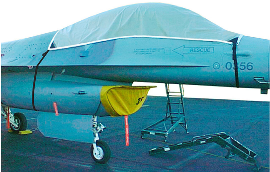
Canopy Cover, F-16

Travel Covers are made with Silver Solution-Dyed Polyester fabric and only lined over the windshield to save weight. The material is lightweight and more compact for easy stowage in the aircraft. The polyester material is water resistant, but only intended for occasional use outside. We also have an ultra lightweight material available for fitted hangar dust covers. For daily outdoor use, the non-travel Sunbrella Cover is the best choice.