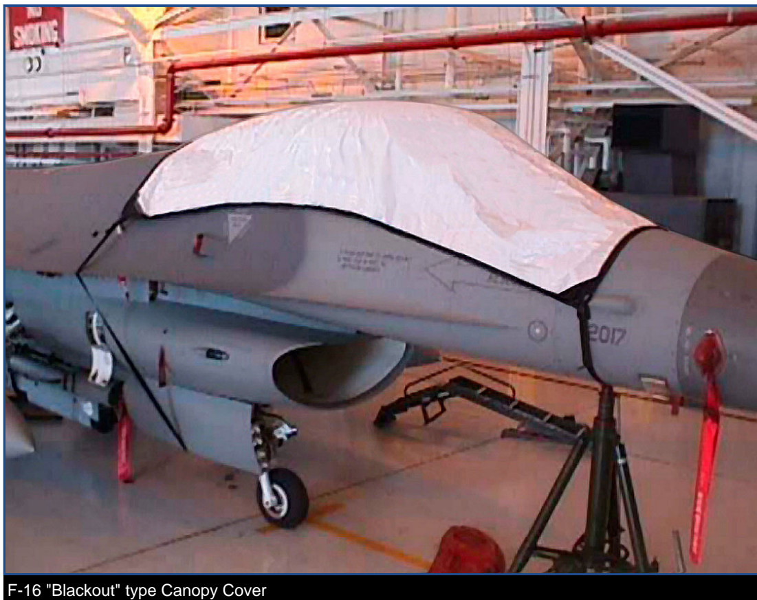
F-16 "Blackout" type Canopy Cover