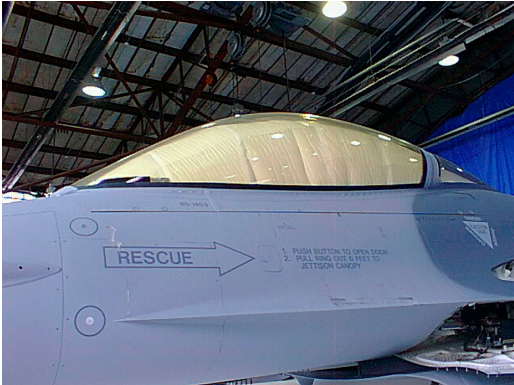
General Dynamics F-16 Cockpit HeatShields