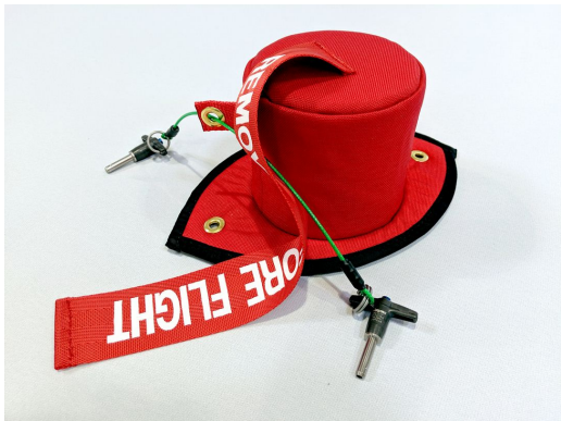
General Dynamics F-16 AOA Probe Cover

The Engine Inlet Plugs are custom fit for your General Dynamics F-16 Fighting Falcon intakes, made with heavy-duty vinyl material, and stuffed with a single block of sculpted urethane foam. Each plug has a zipper that allows the foam to be removed and dried if necessary. Engine plugs have 'remove before flight' streamers sewn onto the face of the plugs. Most plugs are imprinted with the aircraft registration number in black for an extra charge. Storage bag NOT included. Engine plugs may be inserted after flight when the engine is still warm. Engine Inlet Plugs are commonly referred to as Cowl Plugs, Intake Plugs, Cowl Blocks, Engine Blocks, and Engine Bungs.