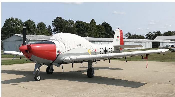
Focke Wulf F149 Canopy Cover, Wing Covers, Engine Plugs

of the Canopy Cover and Engine Cover. This cover will enclose the engine cowl and will extend aft to cover all of the windows. This cover type is made from Silver Acrylic Sunbrella canvas and is 100% lined with a soft and smooth microfiber. Bruce's Custom Covers developed this material combination especially for aircraft protection. The outer material is medium weight and treated for water resistance, UV resistance and anti-static buildup. The inner lining is a very soft and smooth microfiber to prevent scratching. The material is very reflective, and tests show that the cabin interior temperature can be reduced to near-ambient temperature on the hottest of days. It is water, ice and snow repellent, yet breathable to allow moisture to escape from between the cover and the aircraft surface.