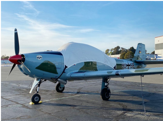
Focke Wulf 149 Trainer Canopy Cover

of the Canopy Cover and Engine Cover. This cover will enclose the engine cowl and will extend aft to cover all of the windows. This cover type is made from Silver Acrylic Sunbrella canvas and is 100% lined with a soft and smooth microfiber. Bruce's Custom Covers developed this material combination especially for aircraft protection. The outer material is medium weight and treated for water resistance, UV resistance and anti-static buildup. The inner lining is a very soft and smooth microfiber to prevent scratching. The material is very reflective, and tests show that the cabin interior temperature can be reduced to near-ambient temperature on the hottest of days. It is water, ice and snow repellent, yet breathable to allow moisture to escape from between the cover and the aircraft surface.