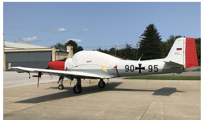
Focke Wulf F149 Canopy Cover, Wing Covers