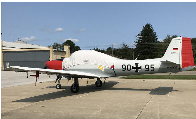
Focke Wulf F149 Canopy Cover, Wing Covers

WINTER USE MATERIAL - Made with Solution-Dyed Polyester fabric, this option is intended for seasonal use to aid in deicing, rain mitigation, or for occasional travel. The material is lighter and more compact, but more susceptible to UV damage and may have a shorter useful life if used continuously outside than the all-year use material.