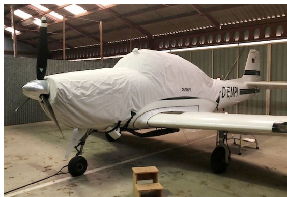
Piaggio FW-149D Canopy/Engine Cover