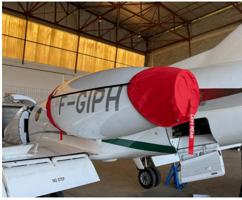
Falcon 10 Engine Covers, no TR's