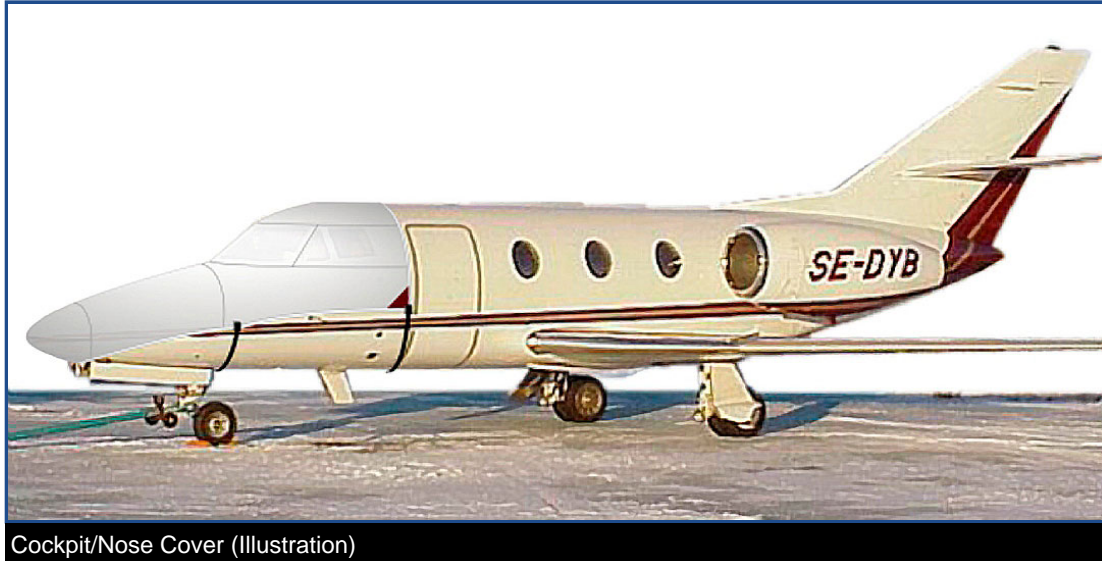
Cockpit/Nose Cover (Illustration)