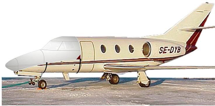
Cockpit/Nose Cover (Illustration)