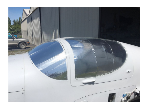
Europa Cabin HeatShields