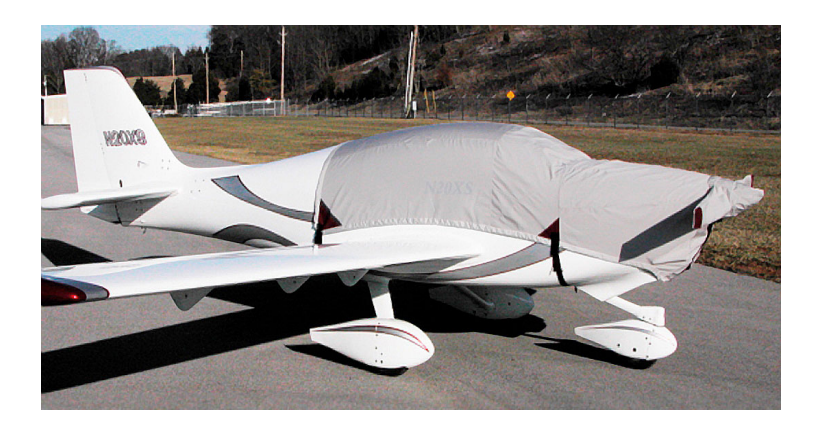
Canopy/Engine and Prop/Spinner Covers (tri-gear model)

This cover type is made from Silver Acrylic Sunbrella canvas and is 100% lined with a soft and smooth microfiber. Bruce's Custom Covers developed this material combination especially for aircraft protection. The outer material is medium weight and treated for water resistance, UV resistance and anti-static buildup. The inner lining is a very soft and smooth microfiber to prevent scratching. The material is very reflective, and tests show that the cabin interior temperature can be reduced to near-ambient temperature on the hottest of days. It is water, ice and snow repellent, yet breathable to allow moisture to escape from between the cover and the aircraft surface.