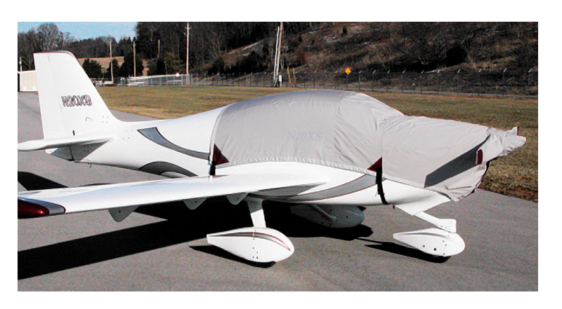
Canopy/Engine and Prop/Spinner Covers (tri-gear model)