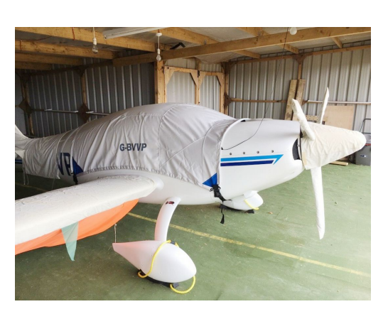
Europa Canopy Cover