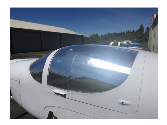
Europa Cabin HeatShields

Heatshields are interior sunshades for an aircraft's windows or canopy glass. The product is a unique composite of closed-cell foam with a silver mylar finish. The semi-rigid design is stiff enough to stand along the inside of the windshield using sun visors or window framing. It folds up flat and easily stores in the included storage sleeve. Some designs may require velcro and suction cups. A Heatshield is an excellent short-term remedy for cockpit overheating.