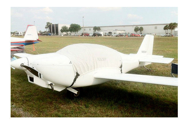
Europa XS Canopy Cover

The Europa All Europa Models Canopy/Engine Cover is a one-piece cover (100% lined with microfiber) that is a combination of the Canopy Cover and Engine Cover. This cover will enclose the engine cowl and will extend aft to cover all of the windows. This cover type is made from Silver Acrylic Sunbrella canvas and is 100% lined with a soft and smooth microfiber. Bruce's Custom Covers developed this material combination especially for aircraft protection. The outer material is medium weight and treated for water resistance, UV resistance and anti-static buildup. The inner lining is a very soft and smooth microfiber to prevent scratching. The material is very reflective, and tests show that the cabin interior temperature can be reduced to near-ambient temperature on the hottest of days. It is water, ice and snow repellent, yet breathable to allow moisture to escape from between the cover and the aircraft surface.