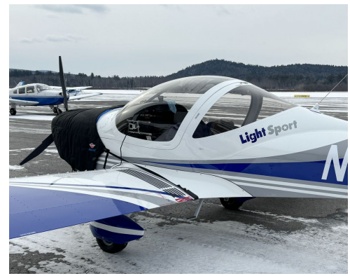
Evektor Harmony Insulated Engine Cover