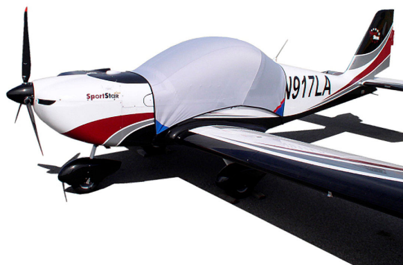
Evektor Sportstar Light Weight Travel-Cover