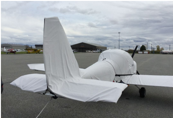
Evektor Sportstar Full Cover Set

This cover type is made from Silver Acrylic Sunbrella canvas and is 100% lined with a soft and smooth microfiber. Bruce's Custom Covers developed this material combination especially for aircraft protection. The outer material is medium weight and treated for water resistance, UV resistance and anti-static buildup. The inner lining is a very soft and smooth microfiber to prevent scratching. The material is very reflective, and tests show that the cabin interior temperature can be reduced to near-ambient temperature on the hottest of days. It is water, ice and snow repellent, yet breathable to allow moisture to escape from between the cover and the aircraft surface.