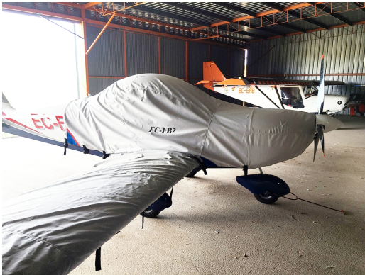
Evektor-Aerotechnik SportStar/Eurostar Extended Canopy/Engine Cover