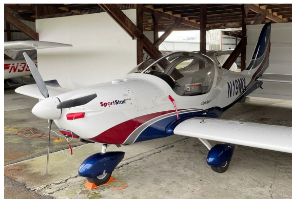
Evektor SportStar Engine & Vent Plugs

Engine Inlet Plugs are custom fit for your Evektor-Aerotechnik SportStar, Eurostar, Max, Harmony intakes, made with heavy-duty vinyl material, and stuffed with a single block of sculpted urethane foam. Each plug has a zipper that allows the foam to be removed and dried if necessary. Engine plugs have warning flags that are visible from the cockpit or 'remove before flight' streamers sewn onto the face of the plugs. Most plugs are imprinted with the aircraft registration number in black for an extra charge. Storage bag NOT included. Engine plugs may be inserted after flight when the engine is still warm. Engine Inlet Plugs are commonly referred to as Cowl Plugs, Intake Plugs, Cowl Blocks, Engine Blocks, and Engine Bungs.