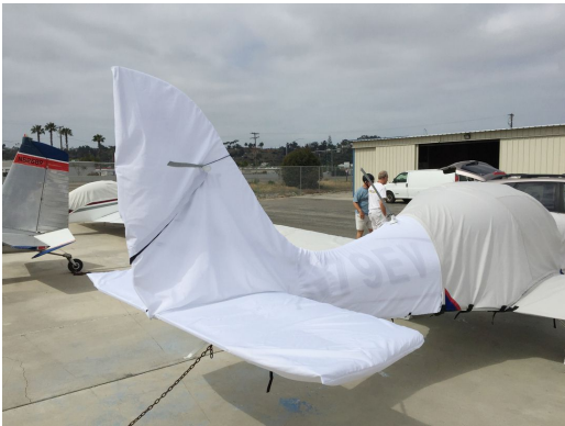
Evektor SportStar, Eurostar, Max Empennage Cover, test fit cover.

shorter useful life if used continuously outside than the all-year use material.