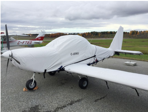
Evektor Sportstar Full Cover Set