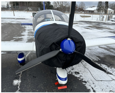
Evektor Harmony Insulated Engine Cover