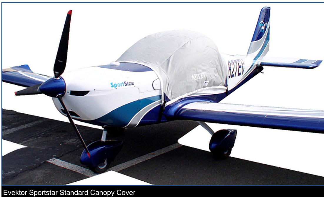
Evektor Sportstar Standard Canopy Cover