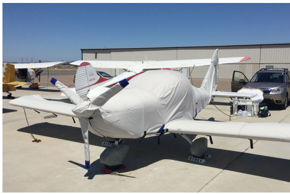
2017 Evektor Sportstar Max All Year Use Wing Covers