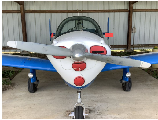
Ercoupe Engine Inlet Plugs