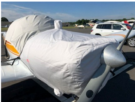
Ercoupe 415-C Fully Enclosed Engine Cover