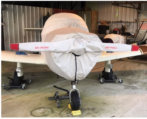
Ercoupe Extended Canopy/Engine & Prop Cover