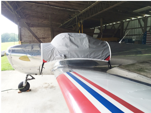
Ercoupe Light Weight Travel Cover