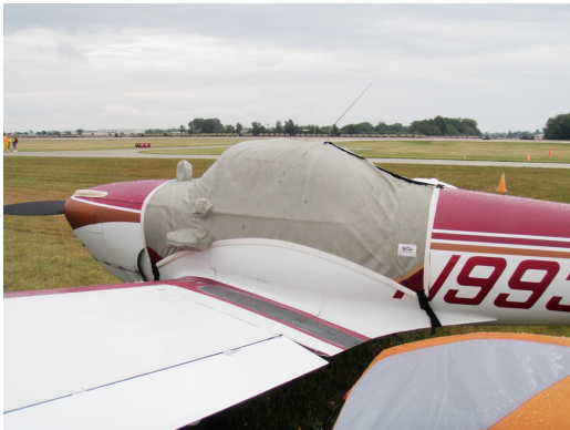
Ercoupe Canopy Cover, bubble windshield model

This cover type is made from Silver Acrylic Sunbrella canvas and is 100% lined with a soft and smooth microfiber. Bruce's Custom Covers developed this material combination especially for aircraft protection. The outer material is medium weight and treated for water resistance, UV resistance and anti-static buildup. The inner lining is a very soft and smooth microfiber to prevent scratching. The material is very reflective, and tests show that the cabin interior temperature can be reduced to near-ambient temperature on the hottest of days. It is water, ice and snow repellent, yet breathable to allow moisture to escape from between the cover and the aircraft surface.