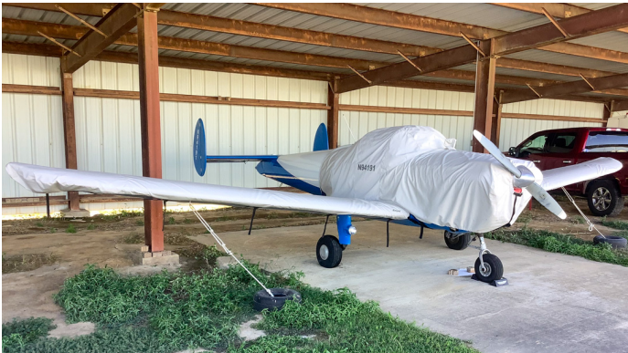
Ercoupe 415-C Wing Covers, All Year Use(set of 2)