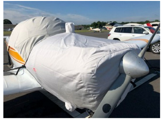
Ercoupe 415-C Fully Enclosed Engine Cover