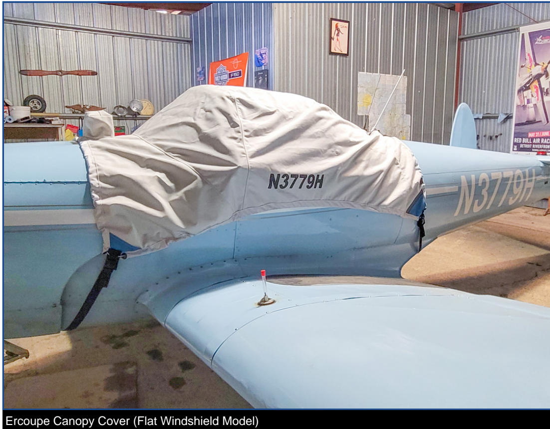
Ercoupe Canopy Cover (Flat Windshield Model)