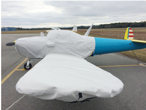
Ercoupe Extended Canopy/Engine Cover, and Wing Covers

This cover type is made from Silver Acrylic Sunbrella canvas and is 100% lined with a soft and smooth microfiber. Bruce's Custom Covers developed this material combination especially for aircraft protection. The outer material is medium weight and treated for water resistance, UV resistance and anti-static buildup. The inner lining is a very soft and smooth microfiber to prevent scratching. The material is very reflective, and tests show that the cabin interior temperature can be reduced to near-ambient temperature on the hottest of days. It is water, ice and snow repellent, yet breathable to allow moisture to escape from between the cover and the aircraft surface.