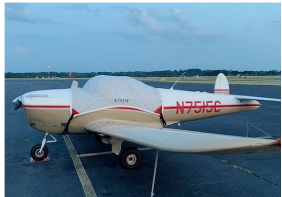
Ercoupe Canopy Cover