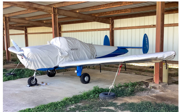
Ercoupe 415-C Wing Covers, All Year Use (set of 2)