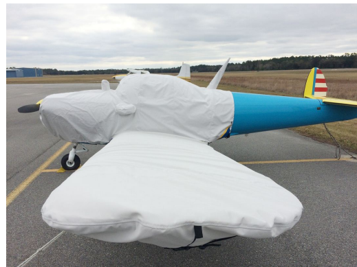
Ercoupe Extended Canopy/Engine Cover, and Wing Covers