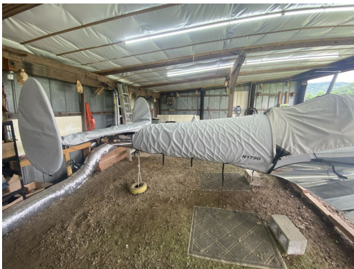
Ercoupe Empennage Cover

WINTER USE MATERIAL - Made with Solution-Dyed Polyester fabric, this option is intended for seasonal use to aid in deicing, rain mitigation, or for occasional travel. The material is lighter and more compact, but more susceptible to UV damage and may have a shorter useful life if used continuously outside than the all-year use material.