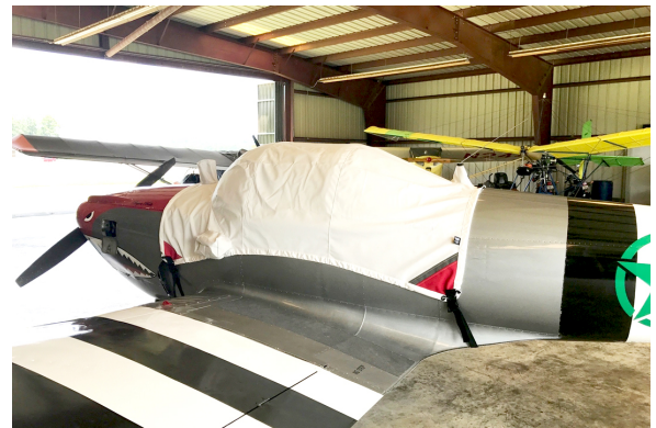
Ercoupe Canopy Cover (Bubble Windshield Model)