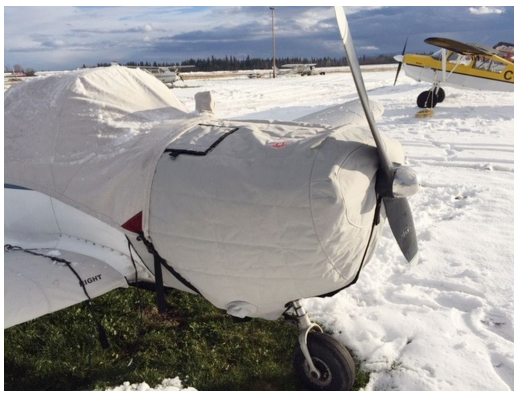
Ercoupe Insulated Engine Cover