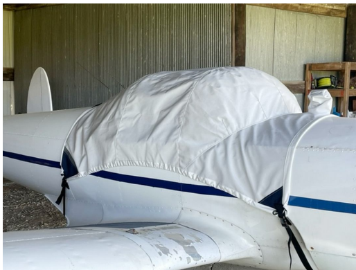
ERCOUPE 415-C Canopy Cover

This cover type is made from Silver Acrylic Sunbrella canvas and is 100% lined with a soft and smooth microfiber. Bruce's Custom Covers developed this material combination especially for aircraft protection. The outer material is medium weight and treated for water resistance, UV resistance and anti-static buildup. The inner lining is a very soft and smooth microfiber to prevent scratching. The material is very reflective, and tests show that the cabin interior temperature can be reduced to near-ambient temperature on the hottest of days. It is water, ice and snow repellent, yet breathable to allow moisture to escape from between the cover and the aircraft surface.