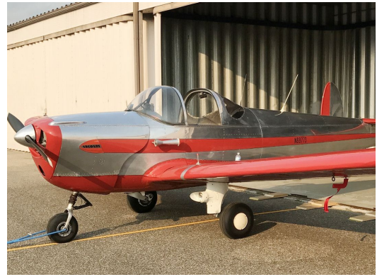
Ercoupe Pitot Cover