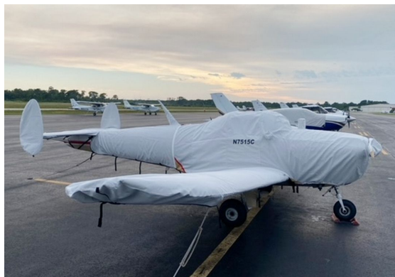
Ercoupe Complete Cover Set