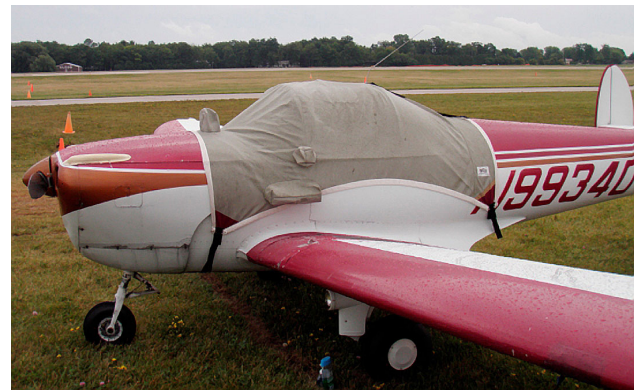
Ercoupe Canopy Cover, flat windshield model