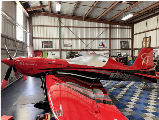
Gamebird GB-1 Solar Cap (single place), CUSTOM COVERS & IMPRINTING AVAILABLE!