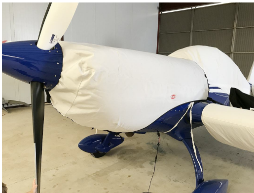
Extra 300, 330SC & 200/230 Models Engine Cover

This cover type is made from Silver Acrylic Sunbrella canvas and is 100% lined with a soft and smooth microfiber. Bruce's Custom Covers developed this material combination especially for aircraft protection. The outer material is medium weight and treated for water resistance, UV resistance and anti-static buildup. The inner lining is a very soft and smooth microfiber to prevent scratching. The material is very reflective, and tests show that the cabin interior temperature can be reduced to near-ambient temperature on the hottest of days. It is water, ice and snow repellent, yet breathable to allow moisture to escape from between the cover and the aircraft surface.