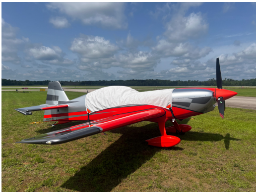
Extra NG Canopy Cover, Single Place Canopy

This cover type is made from Silver Acrylic Sunbrella canvas and is 100% lined with a soft and smooth microfiber. Bruce's Custom Covers developed this material combination especially for aircraft protection. The outer material is medium weight and treated for water resistance, UV resistance and anti-static buildup. The inner lining is a very soft and smooth microfiber to prevent scratching. The material is very reflective, and tests show that the cabin interior temperature can be reduced to near-ambient temperature on the hottest of days. It is water, ice and snow repellent, yet breathable to allow moisture to escape from between the cover and the aircraft surface.