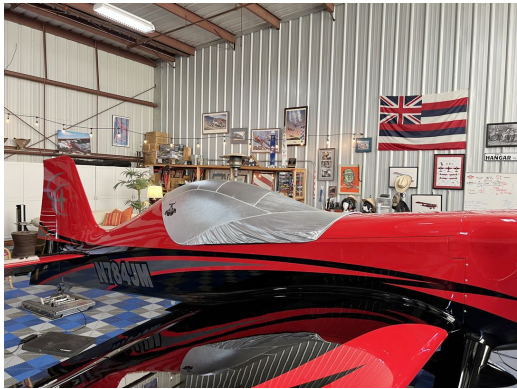
Gamebird GB-1 Solar Cap (single place), CUSTOM COVERS & IMPRINTING AVAILABLE!

Travel Covers are made with Silver Solution-Dyed Polyester fabric and only lined over the windshield to save weight. The material is lightweight and more compact for easy stowage in the aircraft. The polyester material is water resistant, but only intended for occasional use outside. We also have an ultra lightweight material available for fitted hangar dust covers. For daily outdoor use, the non-travel Sunbrella Cover is the best choice.