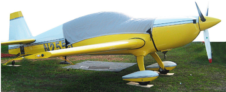
Xtremear Canopy Cover