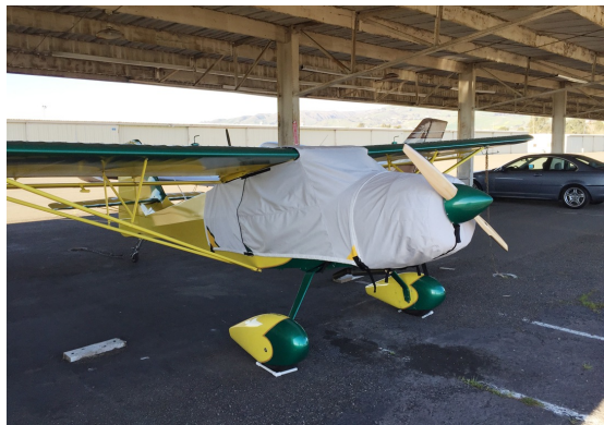
Kitfox Canopy & Engine Covers

This cover type is made from Silver Acrylic Sunbrella canvas and is 100% lined with a soft and smooth microfiber. Bruce's Custom Covers developed this material combination especially for aircraft protection. The outer material is medium weight and treated for water resistance, UV resistance and anti-static buildup. The inner lining is a very soft and smooth microfiber to prevent scratching. The material is very reflective, and tests show that the cabin interior temperature can be reduced to near-ambient temperature on the hottest of days. It is water, ice and snow repellent, yet breathable to allow moisture to escape from between the cover and the aircraft surface.