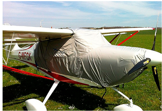
EuroFox and Aerotrek A240 Lightweight Travel Canopy/Engine Cover