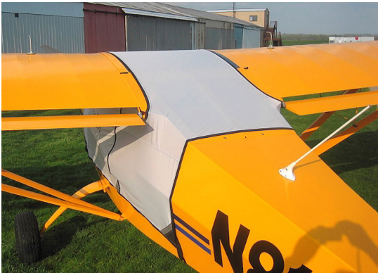
EuroFox and Aerotrek A240 Lightweight Travel Canopy/Engine Cover Aerotrek A240 Spandex FlyAway Travel Canopy Cover