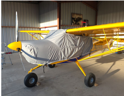
Aerotrek Eurofox Travel Canopy/Engine Cover

Travel Covers are made with Silver Solution-Dyed Polyester fabric and only lined over the windshield to save weight. The material is lightweight and more compact for easy stowage in the aircraft. The polyester material is water resistant, but only intended for occasional use outside. We also have an ultra lightweight material available for fitted hangar dust covers. For daily outdoor use, the non-travel Sunbrella Cover is the best choice.