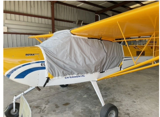
Eurofox Travel Weight Canopy Cover