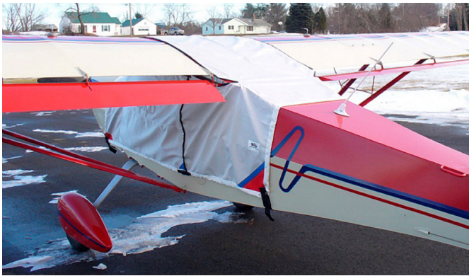
Kitfox IV Over-the-top Canopy Cover

This cover type is made from Silver Acrylic Sunbrella canvas and is 100% lined with a soft and smooth microfiber. Bruce's Custom Covers developed this material combination especially for aircraft protection. The outer material is medium weight and treated for water resistance, UV resistance and anti-static buildup. The inner lining is a very soft and smooth microfiber to prevent scratching. The material is very reflective, and tests show that the cabin interior temperature can be reduced to near-ambient temperature on the hottest of days. It is water, ice and snow repellent, yet breathable to allow moisture to escape from between the cover and the aircraft surface.