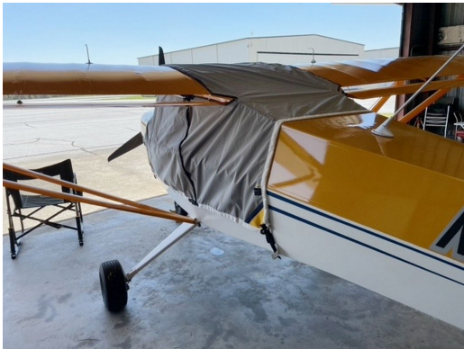
Eurofox Travel Weight Canopy CoverDia

Travel Covers are made with Silver Solution-Dyed Polyester fabric and only lined over the windshield to save weight. The material is lightweight and more compact for easy stowage in the aircraft. The polyester material is water resistant, but only intended for occasional use outside. We also have an ultra lightweight material available for fitted hangar dust covers. For daily outdoor use, the non-travel Sunbrella Cover is the best choice.