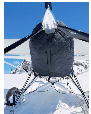
FOR INTERIOR USE. Cub Crafters CC-11 Insulated Hangar Blanket, available in Red or Silver Kitfox Insulated Engine Cover