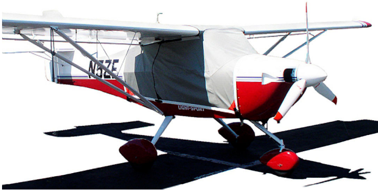
Aerotrek A240 Standard Canopy Cover

This cover type is made from Silver Acrylic Sunbrella canvas and is 100% lined with a soft and smooth microfiber. Bruce's Custom Covers developed this material combination especially for aircraft protection. The outer material is medium weight and treated for water resistance, UV resistance and anti-static buildup. The inner lining is a very soft and smooth microfiber to prevent scratching. The material is very reflective, and tests show that the cabin interior temperature can be reduced to near-ambient temperature on the hottest of days. It is water, ice and snow repellent, yet breathable to allow moisture to escape from between the cover and the aircraft surface.