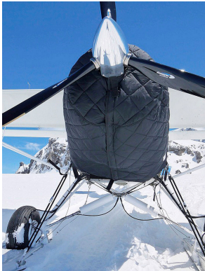
Kitfox Insulated Engine Cover