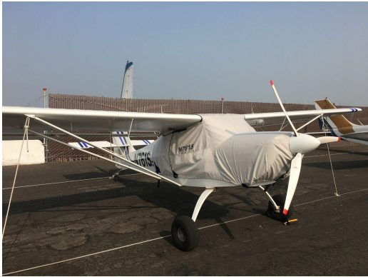
Eurofox Canopy/Engine Cover