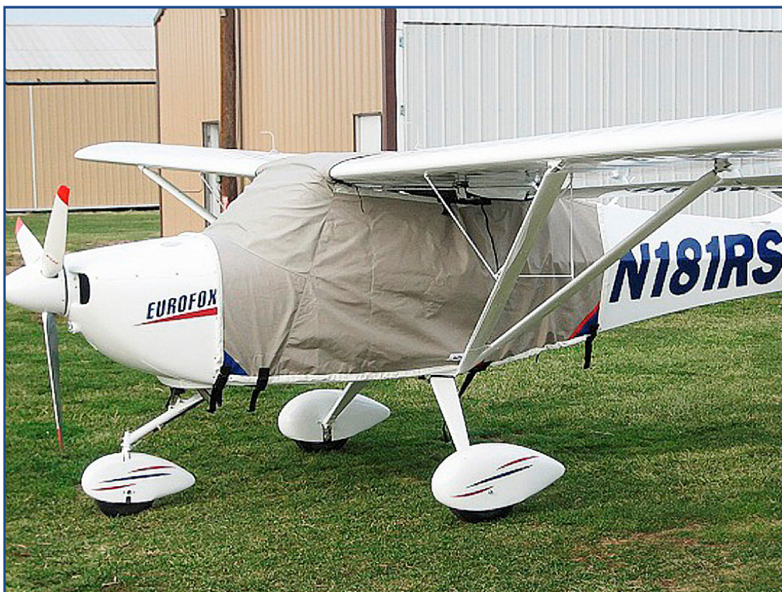
Eurofox LSA Extended Canopy Cover (same as an Aerotrek)