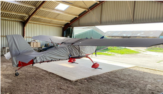
Eurofox Complete Cover Set