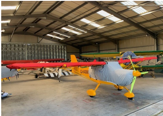
Eurofox Canopy/Engine Cover, light weight travel type