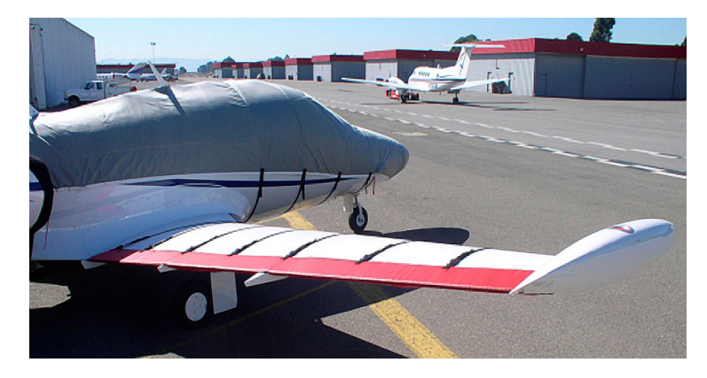
Eclipse Tip Tank & Engine Covers