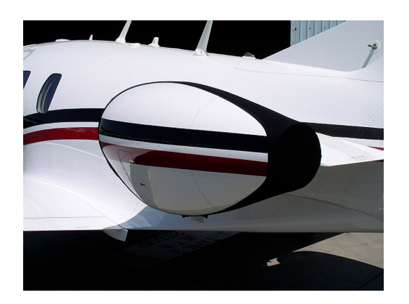
Bikini style Engine Covers