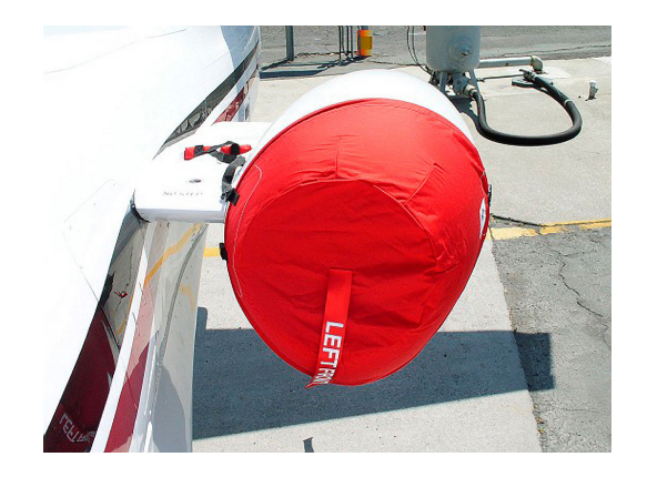
Eclipse Exhaust Cover & Pylon Wedge Plugs

The Eclipse EA500 , TE500 , 550 Bikini Style Engine Covers are a single-piece design using a soft and smooth stretchy and fabric. The cover stretches tightly over both the intake and exhaust, installing quickly and easily. These covers are designed to be used as hangar dust covers and have a useful life of approximately one year.