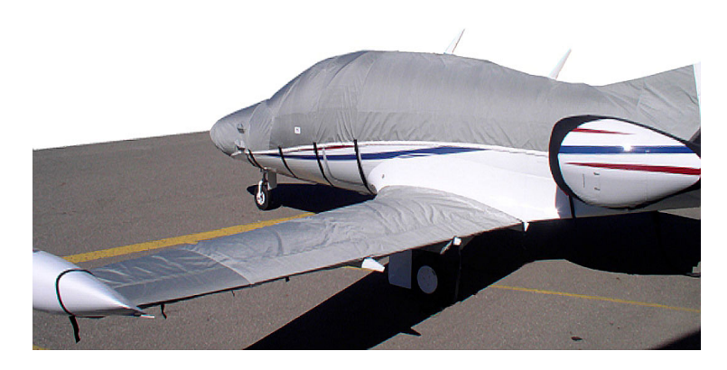
Fuselage Cover & Wing Covers with hail protection on all upper surfaces

WINTER USE MATERIAL - Made with Solution-Dyed Polyester fabric, this option is intended for seasonal use to aid in deicing, rain mitigation, or for occasional travel. The material is lighter and more compact, but more susceptible to UV damage and may have a shorter useful life if used continuously outside than the all-year use material.