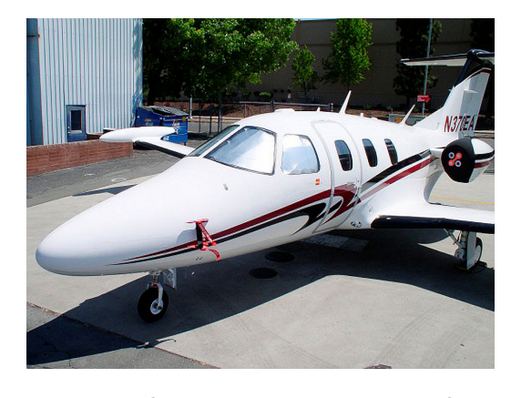
Eclipse Pitot Cover & Bikini Type Engine Covers

This cover type is made from Silver Acrylic Sunbrella canvas and is 100% lined with a soft and smooth microfiber. Bruce's Custom Covers developed this material combination especially for aircraft protection. The outer material is medium weight and treated for water resistance, UV resistance and anti-static buildup. The inner lining is a very soft and smooth microfiber to prevent scratching. The material is very reflective, and tests show that the cabin interior temperature can be reduced to near-ambient temperature on the hottest of days. It is water, ice and snow repellent, yet breathable to allow moisture to escape from between the cover and the aircraft surface.