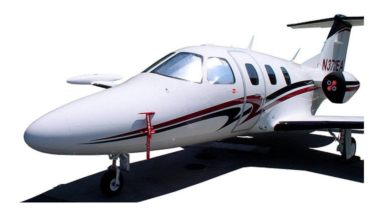
Cockpit HeatShields, Pitot Covers & "Bikini" style Engine Covers