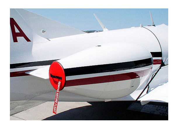
Eclipse Engine Exhaust Plugs set

necessary. Engine plugs have 'remove before flight' streamers sewn onto the face of the plugs. Most plugs are imprinted with the aircraft registration number in black for an extra charge. Storage bag NOT included. Engine plugs may be inserted after flight when the engine is still warm. Engine Inlet Plugs are commonly referred to as Cowl Plugs, Intake Plugs, Cowl Blocks, Engine Blocks, and Engine Bungs.