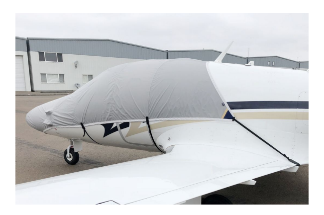
Customized to end before main antenna, with easy to use flat-hook straps.