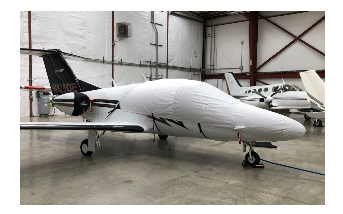
Eclipse EA500 Canopy/Nose Cover, Engine Covers

This cover type is made from Silver Acrylic Sunbrella canvas and is 100% lined with a soft and smooth microfiber. Bruce's Custom Covers developed this material combination especially for aircraft protection. The outer material is medium weight and treated for water resistance, UV resistance and anti-static buildup. The inner lining is a very soft and smooth microfiber to prevent scratching. The material is very reflective, and tests show that the cabin interior temperature can be reduced to near-ambient temperature on the hottest of days. It is water, ice and snow repellent, yet breathable to allow moisture to escape from between the cover and the aircraft surface.