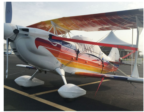
Christen Eagle Canopy Cover