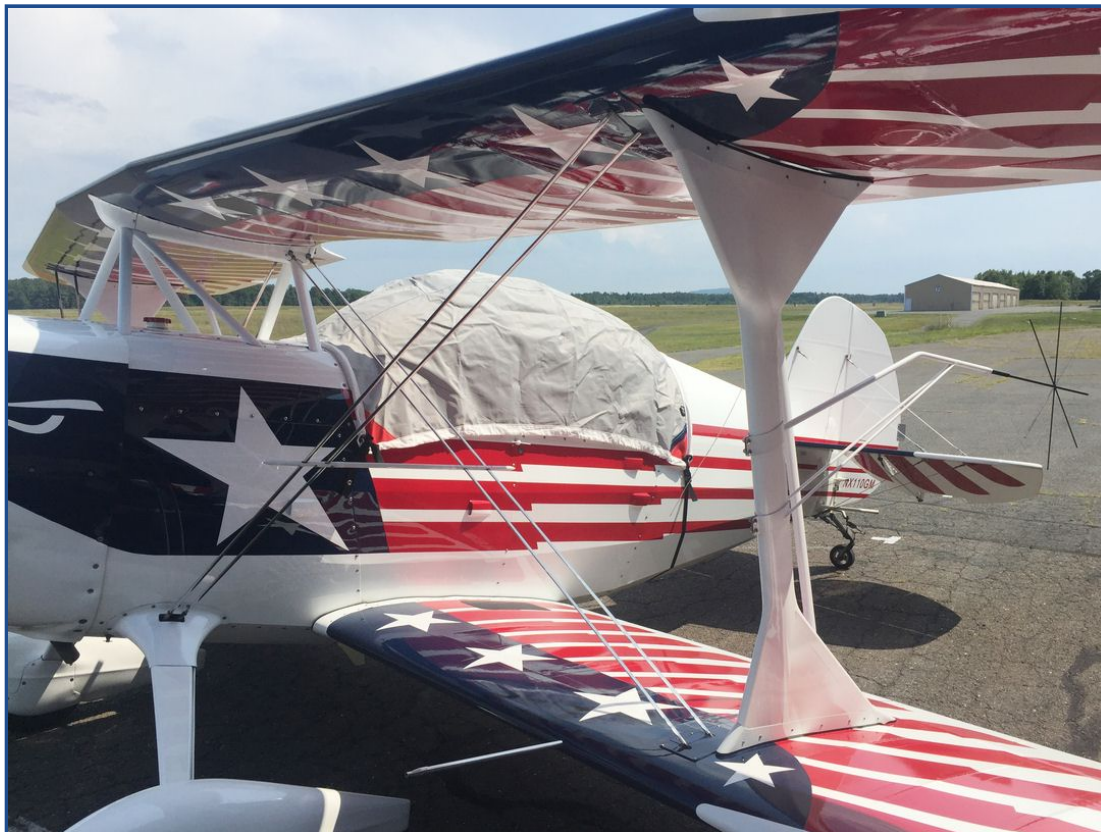
Christen Eagle Light Weight Travel Canopy Cover