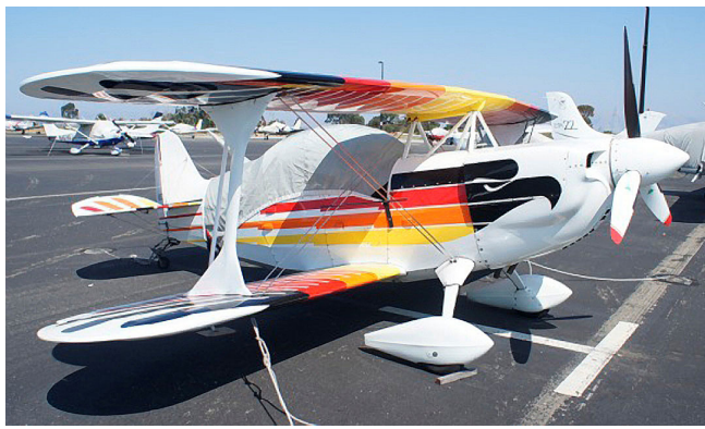
Eagle Canopy Cover, with extension to tail