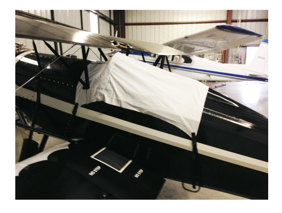
Rose Parrakeet Canopy Cover (test fit cover)