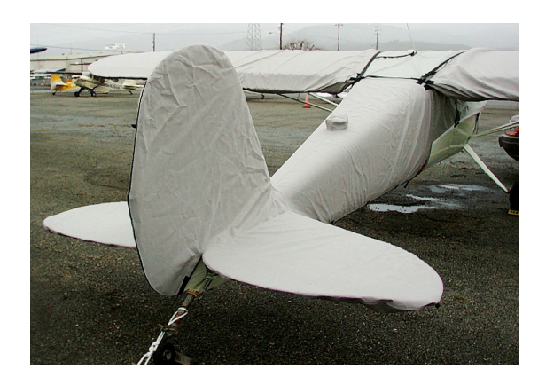
Cessna 120 Empennage Cover

WINTER USE MATERIAL - Made with Solution-Dyed Polyester fabric, this option is intended for seasonal use to aid in deicing, rain mitigation, or for occasional travel. The material is lighter and more compact, but more susceptible to UV damage and may have a shorter useful life if used continuously outside than the all-year use material.