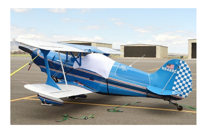
Acro Sport Canopy Cover

the hottest of days. It is water, ice and snow repellent, yet breathable to allow moisture to escape from between the cover and the aircraft surface.