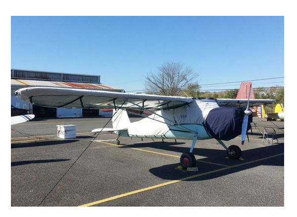
Cessna 140 Canopy, Engine, Wing & Empennage Covers