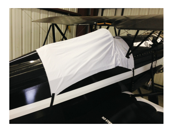
Rose Parrakeet Canopy Cover (test fit cover)

This cover type is made from Silver Acrylic Sunbrella canvas and is 100% lined with a soft and smooth microfiber. Bruce's Custom Covers developed this material combination especially for aircraft protection. The outer material is medium weight and treated for water resistance, UV resistance and anti-static buildup. The inner lining is a very soft and smooth microfiber to prevent scratching. The material is very reflective, and tests show that the cabin interior temperature can be reduced to near-ambient temperature on the hottest of days. It is water, ice and snow repellent, yet breathable to allow moisture to escape from between the cover and the aircraft surface.