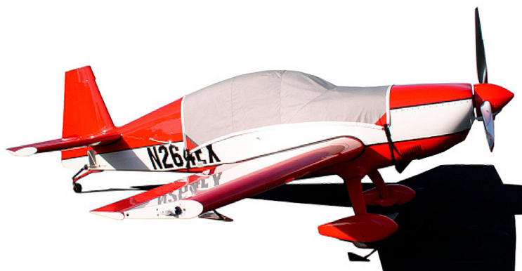
Canopy Cover for the Extra 300

Travel Covers are made with Silver Solution-Dyed Polyester fabric and only lined over the windshield to save weight. The material is lightweight and more compact for easy stowage in the aircraft. The polyester material is water resistant, but only intended for occasional use outside. We also have an ultra lightweight material available for fitted hangar dust covers. For daily outdoor use, the non-travel Sunbrella Cover is the best choice.