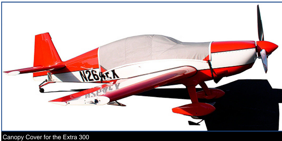
Canopy Cover for the Extra 300