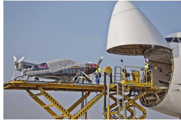
Extra 300 Canopy Cover