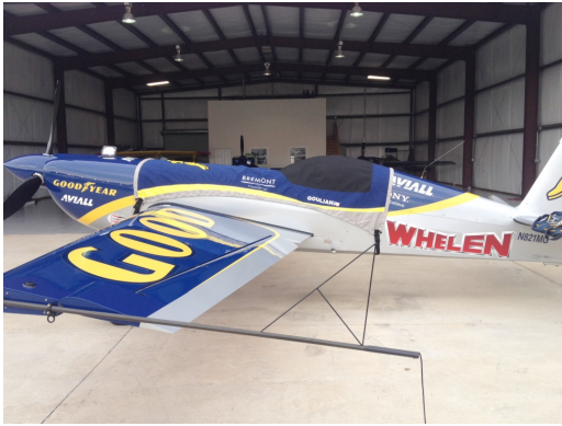
Extra 300SC with NASCAR style custom cover

water resistance, UV resistance and anti-static buildup. The inner lining is a very soft and smooth microfiber to prevent scratching. The material is very reflective, and tests show that the cabin interior temperature can be reduced to near-ambient temperature on the hottest of days. It is water, ice and snow repellent, yet breathable to allow moisture to escape from between the cover and the aircraft surface.