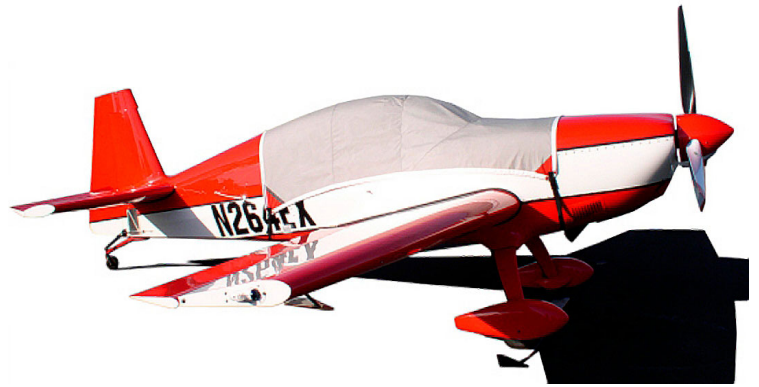
Canopy Cover for the Extra 300