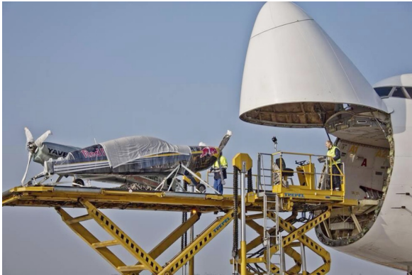
Extra 300 Canopy Cover

water resistance, UV resistance and anti-static buildup. The inner lining is a very soft and smooth microfiber to prevent scratching. The material is very reflective, and tests show that the cabin interior temperature can be reduced to near-ambient temperature on the hottest of days. It is water, ice and snow repellent, yet breathable to allow moisture to escape from between the cover and the aircraft surface.