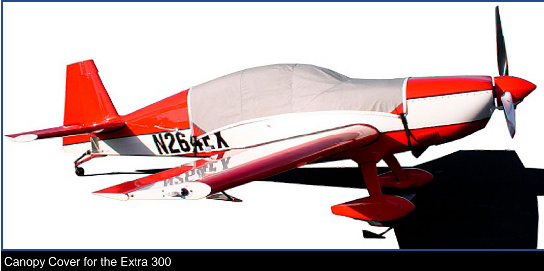
Canopy Cover for the Extra 300