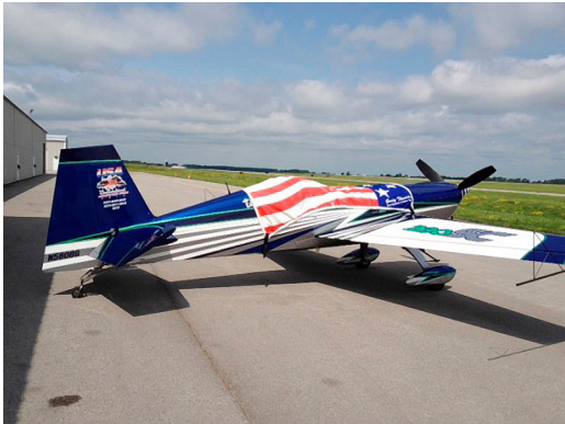
Extra 300SC Canopy Cover with custom artwork