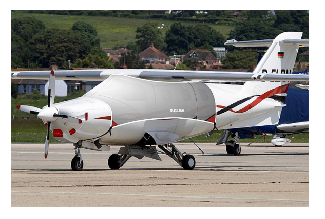
Covers, Plugs & HeatShields for the Extra 400

Engine Inlet Plugs are custom fit for your Extra 400 & 500 intakes, made with heavy-duty vinyl material, and stuffed with a single block of sculpted urethane foam. Each plug has a zipper that allows the foam to be removed and dried if necessary. Engine plugs have warning flags that are visible from the cockpit or 'remove before flight' streamers sewn onto the face of the plugs. Most plugs are imprinted with the aircraft registration number in black for an extra charge. Storage bag NOT included. Engine plugs may be inserted after flight when the engine is still warm. Engine Inlet Plugs are commonly referred to as Cowl Plugs, Intake Plugs, Cowl Blocks, Engine Blocks, and Engine Bungs.