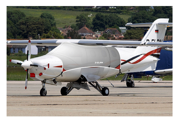
Covers, Plugs & HeatShields for the Extra 400