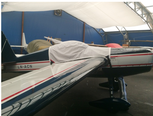
Extra 200 Canopy Cover

This cover type is made from Silver Acrylic Sunbrella canvas and is 100% lined with a soft and smooth microfiber. Bruce's Custom Covers developed this material combination especially for aircraft protection. The outer material is medium weight and treated for water resistance, UV resistance and anti-static buildup. The inner lining is a very soft and smooth microfiber to prevent scratching. The material is very reflective, and tests show that the cabin interior temperature can be reduced to near-ambient temperature on the hottest of days. It is water, ice and snow repellent, yet breathable to allow moisture to escape from between the cover and the aircraft surface.