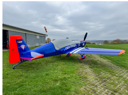
EXTRA 330LT Travel Cover, Light Weight Canopy Cover (2 seat model, Low Wing Models)