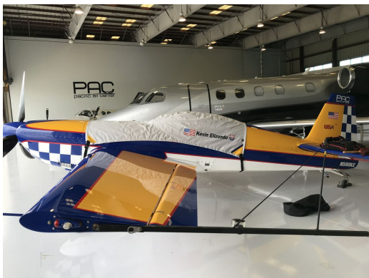
Extra 300S Canopy Cover