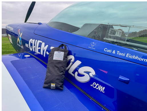
EXTRA 330LT Travel Cover, Light Weight Canopy Cover (2 seat model, Low Wing Models)

Travel Covers are made with Silver Solution-Dyed Polyester fabric and only lined over the windshield to save weight. The material is lightweight and more compact for easy stowage in the aircraft. The polyester material is water resistant, but only intended for occasional use outside. We also have an ultra lightweight material available for fitted hangar dust covers. For daily outdoor use, the non-travel Sunbrella Cover is the best choice.