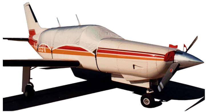
Malibu/Mirage/Meridian Standard Canopy Cover