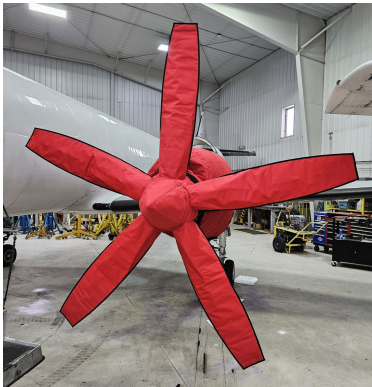
Fairchild Metro 5 Blade Insulated Insulated Prop Covers

This cover type is made from Silver Acrylic Sunbrella canvas and is 100% lined with a soft and smooth microfiber. Bruce's Custom Covers developed this material combination especially for aircraft protection. The outer material is medium weight and treated for water resistance, UV resistance and anti-static buildup. The inner lining is a very soft and smooth microfiber to prevent scratching. The material is very reflective, and tests show that the cabin interior temperature can be reduced to near-ambient temperature on the hottest of days. It is water, ice and snow repellent, yet breathable to allow moisture to escape from between the cover and the aircraft surface.