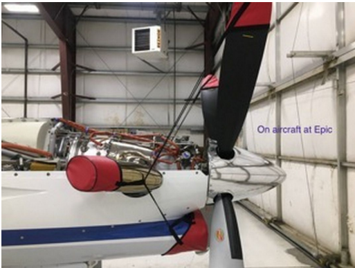
Epic Aircraft Prop Tie, Exhaust & Intake Covers