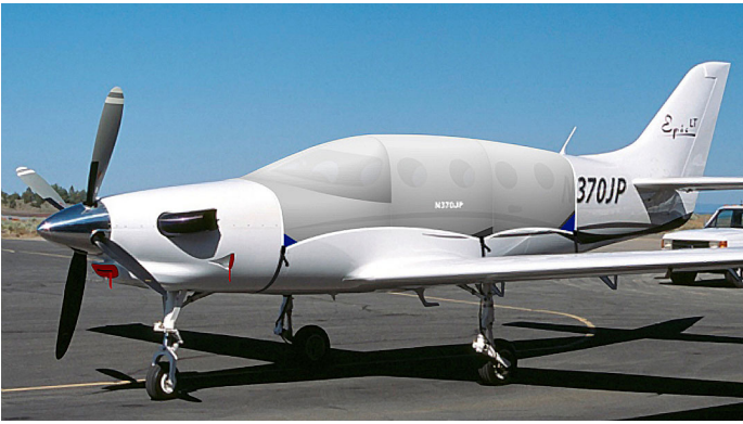
Epic LT Canopy Cover & Engine Plugs