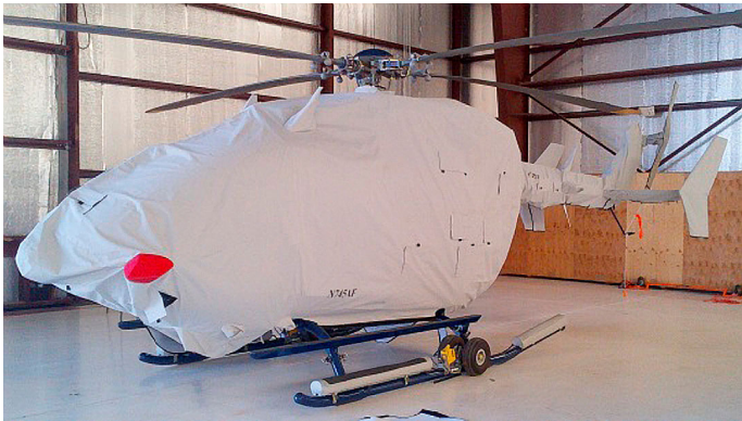
Main Body (also covers bottom), Tailboom, Vertical Pylon, Stabilizers and Tail Rotor Covers

This cover type is made from Silver Acrylic Sunbrella canvas and is 100% lined with a soft and smooth microfiber. Bruce's Custom Covers developed this material combination especially for aircraft protection. The outer material is medium weight and treated for water resistance, UV resistance and anti-static buildup. The inner lining is a very soft and smooth microfiber to prevent scratching. The material is very reflective, and tests show that the cabin interior temperature can be reduced to near-ambient temperature on the hottest of days. It is water, ice and snow repellent, yet breathable to allow moisture to escape from between the cover and the aircraft surface.