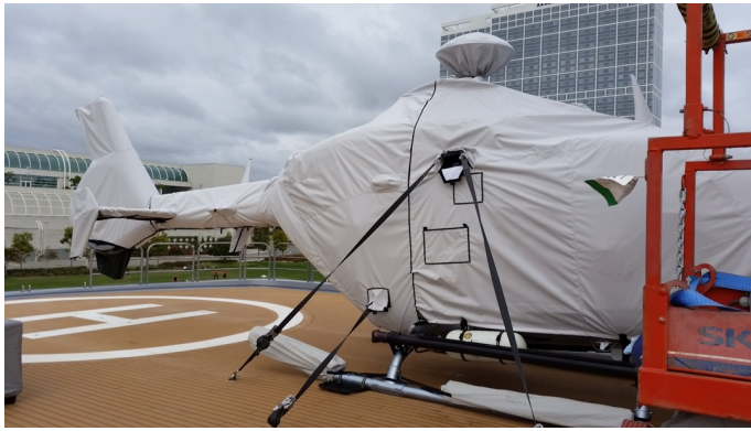
EC-135 Full Cover Set