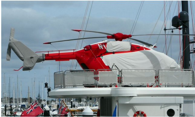
Eurocopter EC-135 Bubble, Engine, Rotor Hub, Tail Surfaces Covers

The Eurocopter EC-135 Intake Cover . Details vary by model, but generally helicopter intake covers are designed to enclose the intake are only. They are smaller than helicopter engine covers, and their attachment details can vary from straps, to snaps, or some combination of the two. Specific information for each model is available on request.