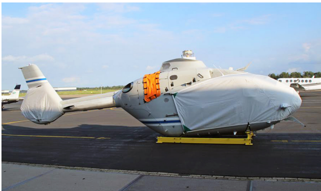
Bubble Cover and Tailfan Cover

The Tailboom Cover details vary by model, but generally the helicopter tail boom cover encloses the tail boom from the "bottleneck" to the aft end. They usually also cover the horizontal stabilizers, and are custom made to allow for antennae, lights, and other protrusions. They attach with straps underneath the tail boom. Covers for the vertical and horizontal stabilizers are also available separately. Specific information for each model is available on request.