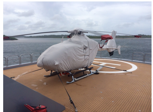
Eurocopter EC-135 Full Body Covers