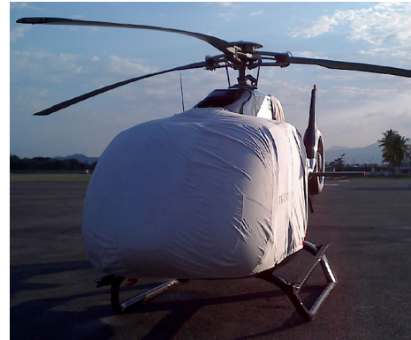
Bubble Cover and Intake/Exhaust Cover