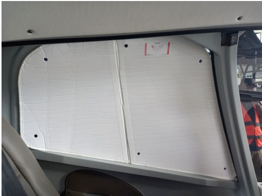
Airbus Helicopter EC130 B4 Side Window Heatshields

Heatshields are interior sunshades for an aircraft's windows or canopy glass. The product is a unique composite of closed-cell foam with a silver mylar finish. The semi-rigid design is stiff enough to stand along the inside of the windshield using sun visors or window framing. It folds up flat and easily stores in the included storage sleeve. Some designs may require velcro and suction cups. A Heatshield is an excellent short-term remedy for cockpit overheating.