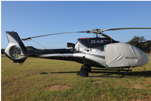
EC-130 Bubble Cover