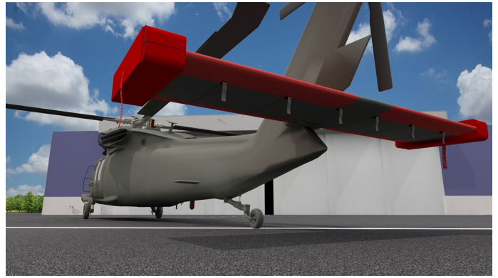
Padded Horizontal Stab Covers, Wingtip Pads (illustration)