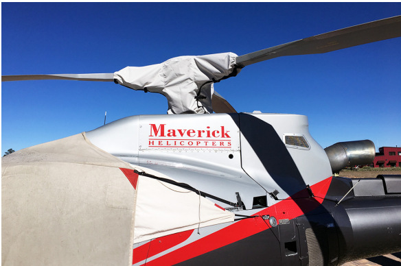
Eurocopter EC-130 Main Rotor Hub Cover

circulation and drainage in freezing weather. Some part numbers have features for an extra charge.