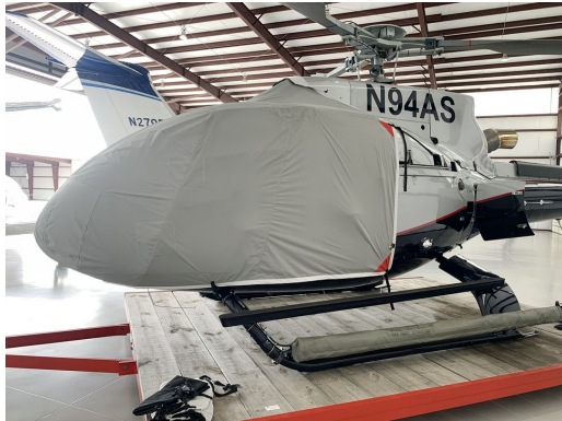
Airbus H-130 Bubble Cover, Travel Weight

This cover type is made from Silver Acrylic Sunbrella canvas and is 100% lined with a soft and smooth microfiber. Bruce's Custom Covers developed this material combination especially for aircraft protection. The outer material is medium weight and treated for water resistance, UV resistance and anti-static buildup. The inner lining is a very soft and smooth microfiber to prevent scratching. The material is very reflective, and tests show that the cabin interior temperature can be reduced to near-ambient temperature on the hottest of days. It is water, ice and snow repellent, yet breathable to allow moisture to escape from between the cover and the aircraft surface.