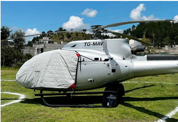
Airbus H-130 Insulated Bubble Cover

This cover type is made from Silver Acrylic Sunbrella canvas and is 100% lined with a soft and smooth microfiber. Bruce's Custom Covers developed this material combination especially for aircraft protection. The outer material is medium weight and treated for water resistance, UV resistance and anti-static buildup. The inner lining is a very soft and smooth microfiber to prevent scratching. The material is very reflective, and tests show that the cabin interior temperature can be reduced to near-ambient temperature on the hottest of days. It is water, ice and snow repellent, yet breathable to allow moisture to escape from between the cover and the aircraft surface.