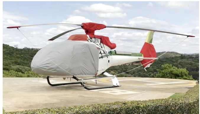
EC130 Bubble, Intake, Exhaust, Rotor Hub & Tailfan Covers