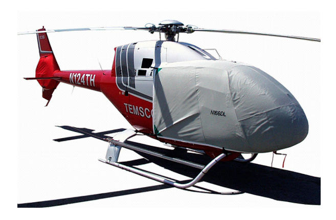
Eurocopter EC-120 Bubble Cover & Tailfan Cover

This cover type is made from Silver Acrylic Sunbrella canvas and is 100% lined with a soft and smooth microfiber. Bruce's Custom Covers developed this material combination especially for aircraft protection. The outer material is medium weight and treated for water resistance, UV resistance and anti-static buildup. The inner lining is a very soft and smooth microfiber to prevent scratching. The material is very reflective, and tests show that the cabin interior temperature can be reduced to near-ambient temperature on the hottest of days. It is water, ice and snow repellent, yet breathable to allow moisture to escape from between the cover and the aircraft surface.