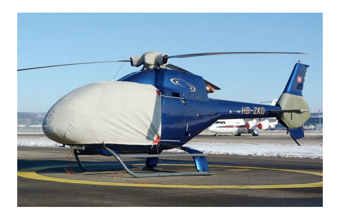
Eurocopter EC-120 Bubble, Rotor Mast & Tailfan Covers