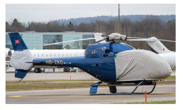
Eurocopter EC-120 Bubble, Rotor Mast & Tailfan Covers