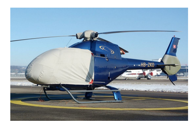
Eurocopter EC-120 Bubble, Rotor Mast & Tailfan Covers