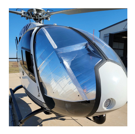
Eurocopter EC-120 Windshield HeatShields