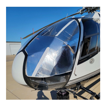
Eurocopter EC-120 Windshield HeatShields

Heatshields are interior sunshades for an aircraft's windows or canopy glass. The product is a unique composite of closed-cell foam with a silver mylar finish. The semi-rigid design is stiff enough to stand along the inside of the windshield using sun visors or window framing. It folds up flat and easily stores in the included storage sleeve. Some designs may require velcro and suction cups. A Heatshield is an excellent short-term remedy for cockpit overheating.