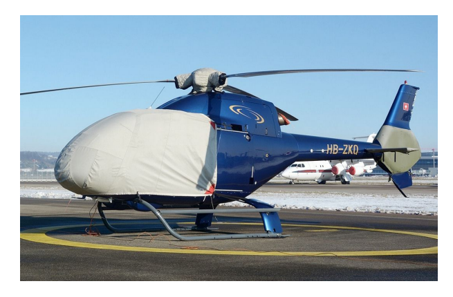
Eurocopter EC-120 Bubble, Rotor Mast & Tailfan Covers

The Tailboom Cover details vary by model, but generally the helicopter tail boom cover encloses the tail boom from the "bottleneck" to the aft end. They usually also cover the horizontal stabilizers, and are custom made to allow for antennae, lights, and other protrusions. They attach with straps underneath the tail boom. Covers for the vertical and horizontal stabilizers are also available separately. Specific information for each model is available on request.