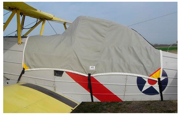
Grumman Ag Cat Canopy Cover