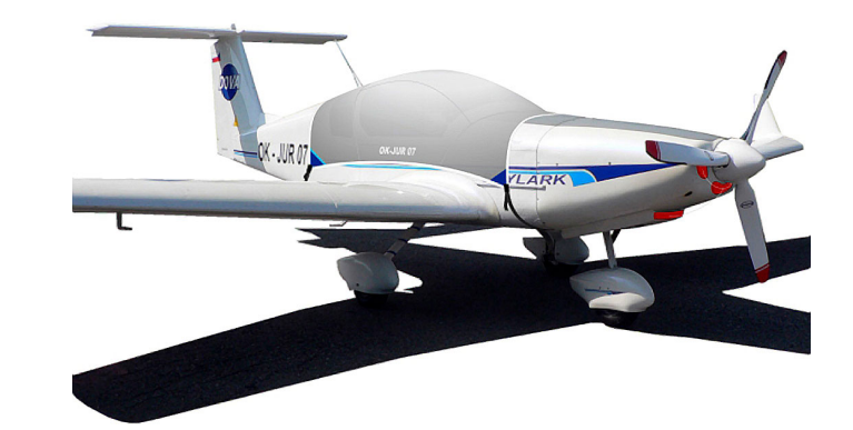
Dova Skylark Standard Canopy Cover and Engine Plugs (illustration)