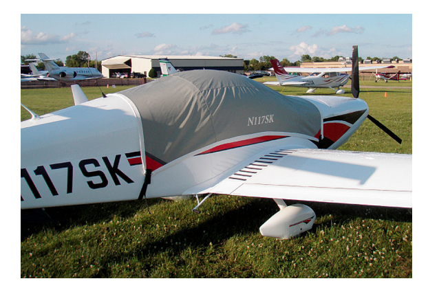
Dova Skylark Standard Canopy Cover

This cover type is made from Silver Acrylic Sunbrella canvas and is 100% lined with a soft and smooth microfiber. Bruce's Custom Covers developed this material combination especially for aircraft protection. The outer material is medium weight and treated for water resistance, UV resistance and anti-static buildup. The inner lining is a very soft and smooth microfiber to prevent scratching. The material is very reflective, and tests show that the cabin interior temperature can be reduced to near-ambient temperature on the hottest of days. It is water, ice and snow repellent, yet breathable to allow moisture to escape from between the cover and the aircraft surface.