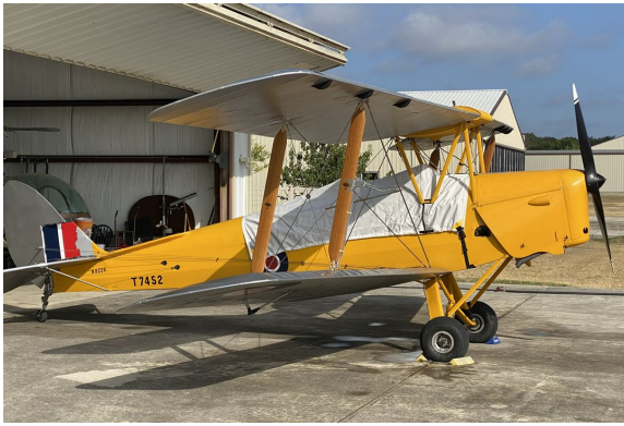
Dehavilland DH-82 Tiger Moth Canopy Cover