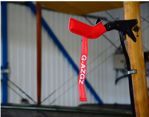
DeHavilland DH-82 Tiger Moth Pitot Cover