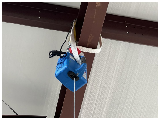
Stearman PT-13 Full Body Dust Cover, Remote Control Winch

Some high value aircraft end up logging lots of hangar time, and become dust magnets in the process. A high quality, well fitting dust cover provides easy assurance that the aircraft's surfaces remain clean and free of grit and grime. Available in a large variety of colors, each dust cover is custom made according to aircraft details and customer preferences. Fire retardant fabrics are also available.