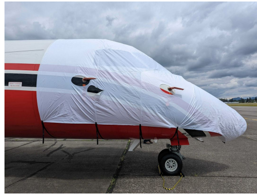
DeHavilland Dash 8, Q400 Cockpit/Nose Cover, test fit cover