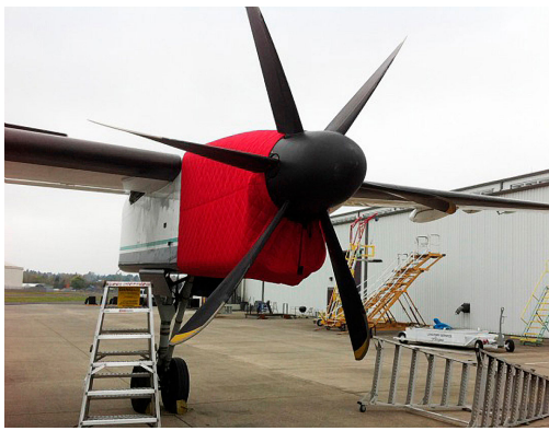
Dash 8-Q400 Insulated Engine Cover