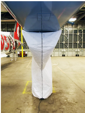
Q400, Main gear landing/tire covers - Cold Weather Ops