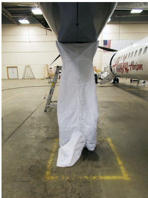
Q400, Main gear landing/tire covers - Cold Weather Ops

ALL-YEAR USE MATERIAL - Made with Silver Acrylic Sunbrella canvas, the all-year use material is the best option for sun protection and cover longevity. This heavier more durable material is intended for all weather conditions, such as rain and snow or lots of sun.