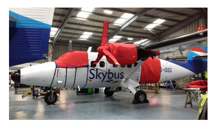
DeHavilland Twin Otter DHC6 (UV-18A) Cockpit Cover (CUSTOM COLOR)