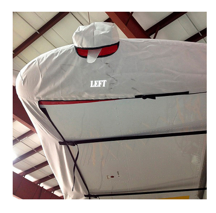
De Havilland Twin Otter Wing Cover wing tip detail

WINTER USE MATERIAL - Made with Solution-Dyed Polyester fabric, this option is intended for seasonal use to aid in deicing, rain mitigation, or for occasional travel. The material is lighter and more compact, but more susceptible to UV damage and may have a shorter useful life if used continuously outside than the all-year use material.