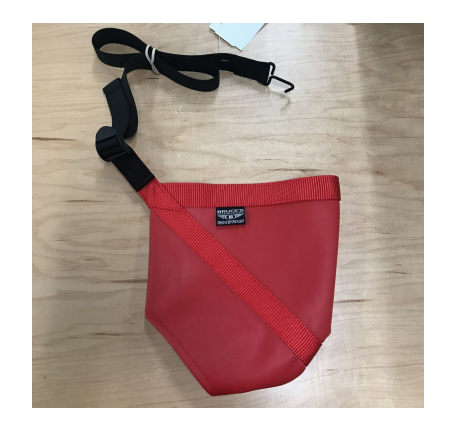
DeHavilland DH-6 Intake Plugs, Exhaust Covers