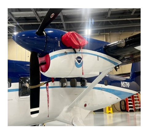
DeHavilland Twin Otter DHC6 Intake Plug, Exhaust Covers