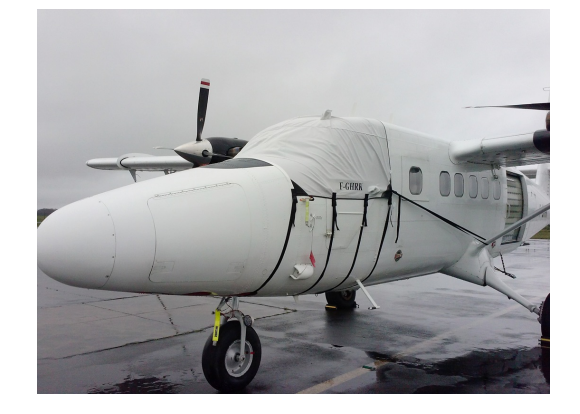
DeHavilland Twin Otter DHC6 (UV-18A) Cockpit Cover (CUSTOM COLOR)