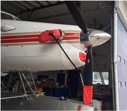
DeHavilland Turbin Otter Intake plugs, Prop Tie/Exhaust Covers