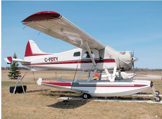
Beaver Windshield/Engine Cover

Travel Covers are made with Silver Solution-Dyed Polyester fabric and only lined over the windshield to save weight. The material is lightweight and more compact for easy stowage in the aircraft. The polyester material is water resistant, but only intended for occasional use outside. We also have an ultra lightweight material available for fitted hangar dust covers. For daily outdoor use, the non-travel Sunbrella Cover is the best choice.