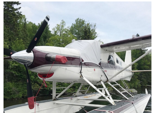
DeHavilland Turbo Beaver Cockpit Cover and Inlet Plug