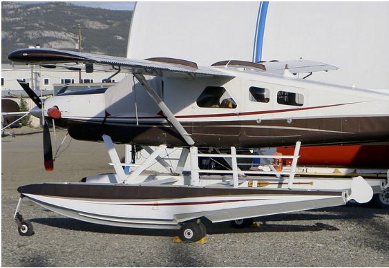
DeHavilland Turbo Beaver Cockpit Covers

This cover type is made from Silver Acrylic Sunbrella canvas and is 100% lined with a soft and smooth microfiber. Bruce's Custom Covers developed this material combination especially for aircraft protection. The outer material is medium weight and treated for water resistance, UV resistance and anti-static buildup. The inner lining is a very soft and smooth microfiber to prevent scratching. The material is very reflective, and tests show that the cabin interior temperature can be reduced to near-ambient temperature on the hottest of days. It is water, ice and snow repellent, yet breathable to allow moisture to escape from between the cover and the aircraft surface.