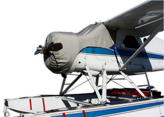
Beaver Windshield/Engine Cover