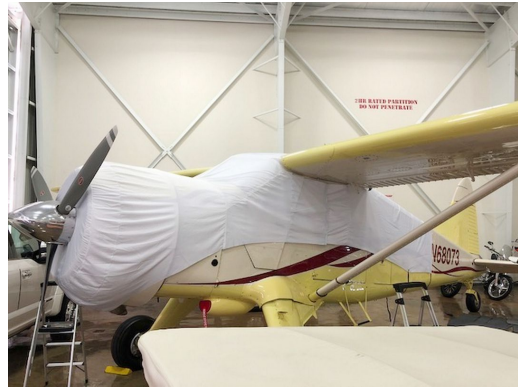
De Havilland Beaver Canopy/Engine Cover, test fit cover