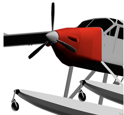
Turbo Beaver Insulated Engine Cover, 3D model