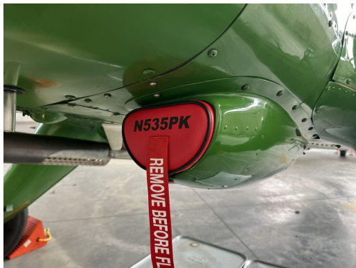
DeHavilland DH-2 Beaver Lower Cowling Oil Scoop Plug

Engine Inlet Plugs are custom fit for your DeHavilland Beaver DHC-2, U-6A, U-6B intakes, made with heavy-duty vinyl material, and stuffed with a single block of sculpted urethane foam. Each plug has a zipper that allows the foam to be removed and dried if necessary. Engine plugs have warning flags that are visible from the cockpit or 'remove before flight' streamers sewn onto the face of the plugs. Most plugs are imprinted with the aircraft registration number in black for an extra charge. Storage bag NOT included. Engine plugs may be inserted after flight when the engine is still warm. Engine Inlet Plugs are commonly referred to as Cowl Plugs, Intake Plugs, Cowl Blocks, Engine Blocks, and Engine Bungs.